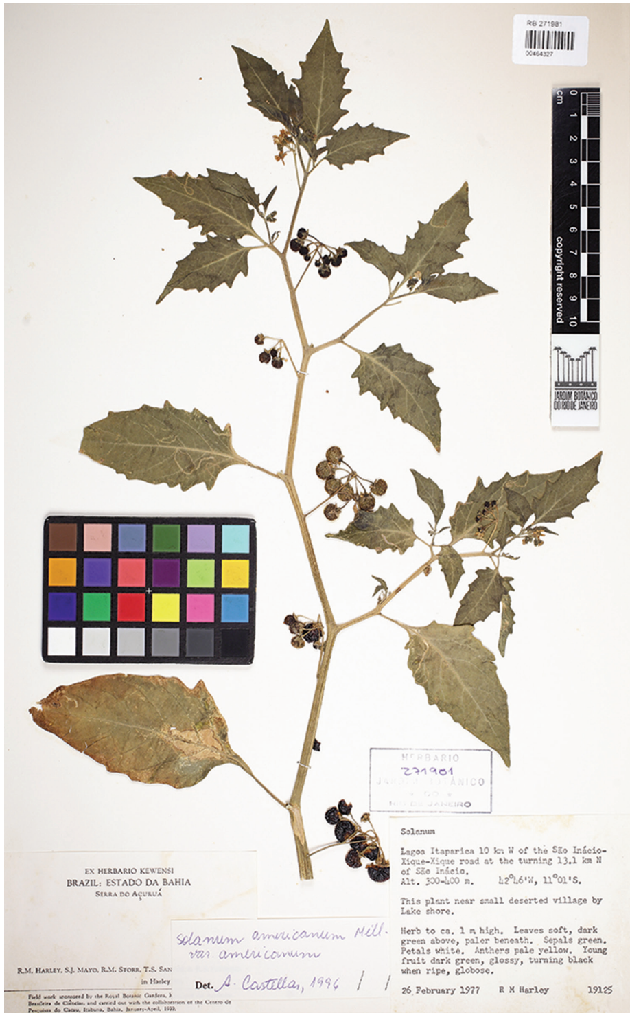
Figure 1. Photograph of the holotype of Solanum caatingae (Harley et al. 19125, RB).