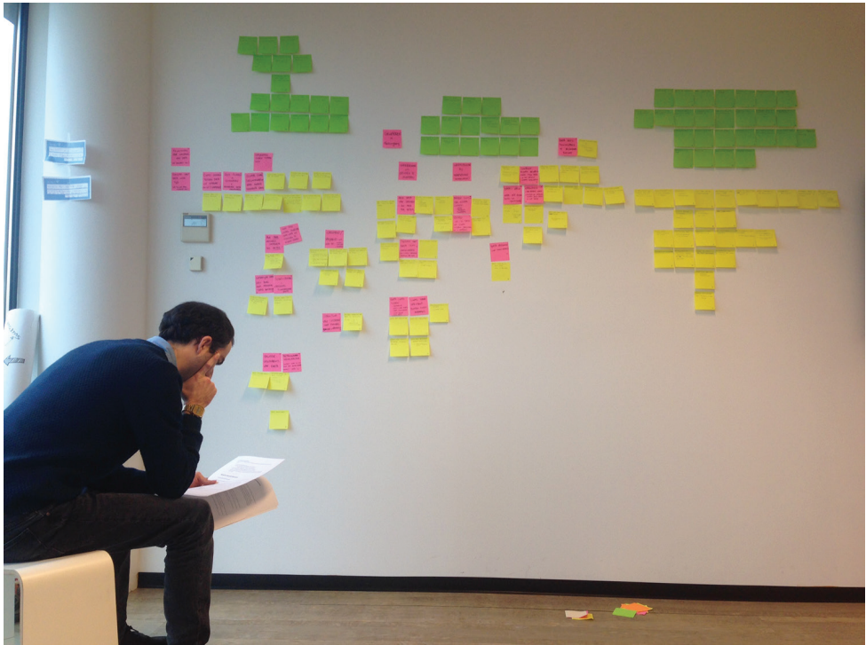
Figure 2. A user experience researcher using affinity diagramming to cluster user requirements from the results of the interviews.

The final step in the analysis approach consisted of manual clustering of closely related needs and insights. These clusters helped to identify overlap among the requirements that were proposed by the different types of researcher. These overlaps served as the basis for defining common user requirements.