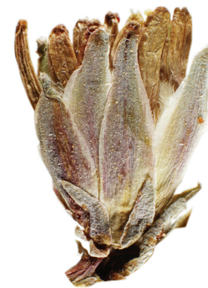
Lactuca denaensis N. Kilian & Djavadi, sp. nov.