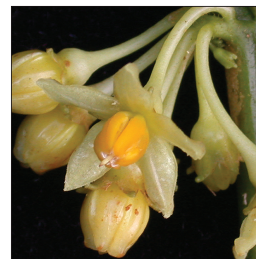
Solanum amorimii S.Knapp & Giacomini, nom. nov.