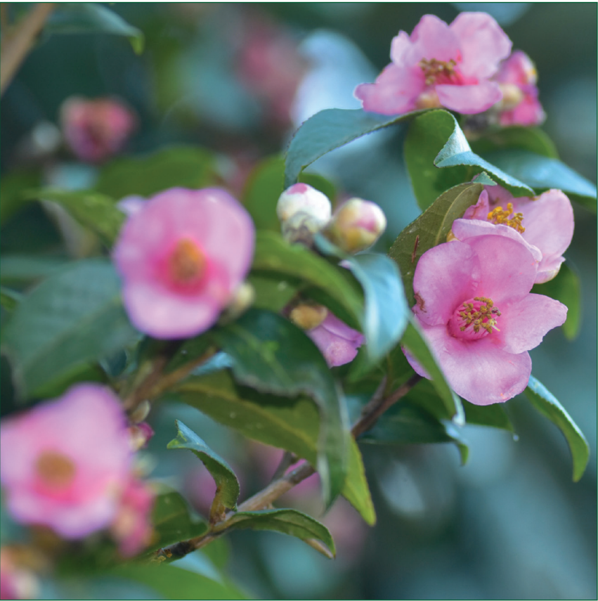
Camellia shuangbaiensis G.P.Yang & B.H.Wu, sp. nov.