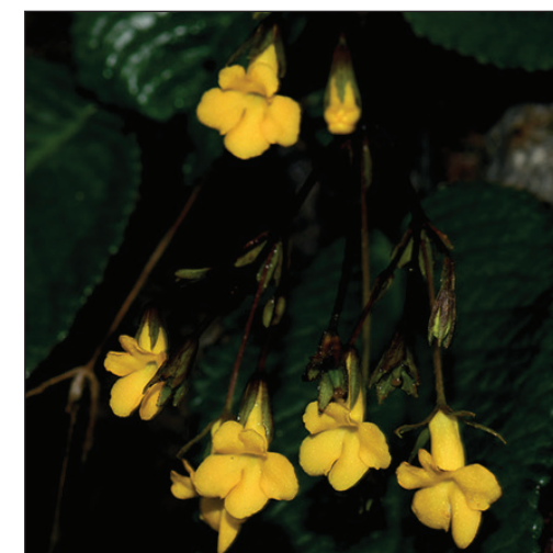
Oreocharis polyneura Y.H.Tan, F.Wen & Y.X.Gong, sp. nov.