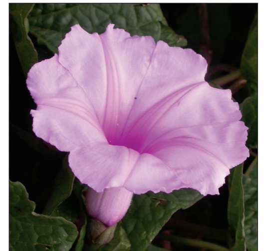
Ipomoea lilloana O'Donnell