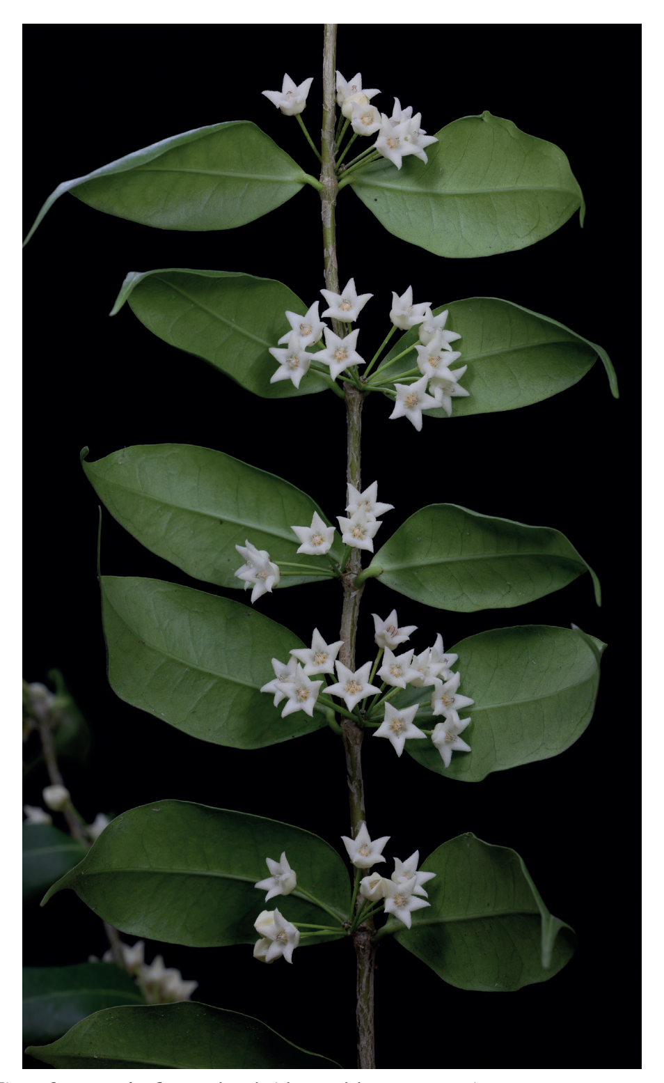
Figure 2. Hoya medusa flowering branch. (Photograph by M.D. De Leon).