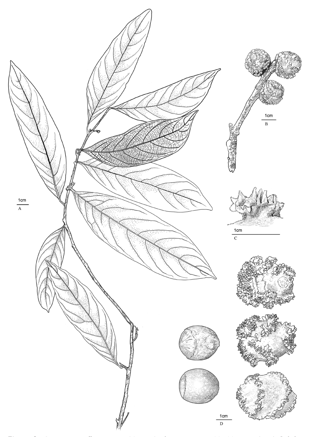
Figure 2. Castanopsis corallocarpus W.H.Tan & Strijk, sp. nov. W.H.Tan TWH002 (KEP) A habit B young infructescence spike C close-up of coral-like spine D mature nuts-bottom, top view and fruits-bottom, top and side view. Illustration by L. Ong.