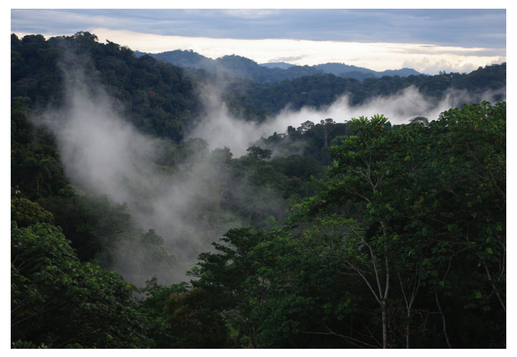
Figure 1. Monts de Cristal National Park, view from Tchimbélé.

visited by botanists and is one of the most densely botanically collected areas in Gabon (Wieringa and Sosef 2011). However, new species have been regularly described from the national park (e.g. Ječmenica et al. 2016; Stévart et al. 2014), including a new genus of Annonaceae, Sirdavidia (Couvreur et al. 2015) which was recently awarded the top 10 new species of 2016 (International Institute for Species Exploration 2016). Here, we describe two new species collected during a botanical trip to the Monts de Cristal National Park in June 2016, one Annonaceae and one rattan.