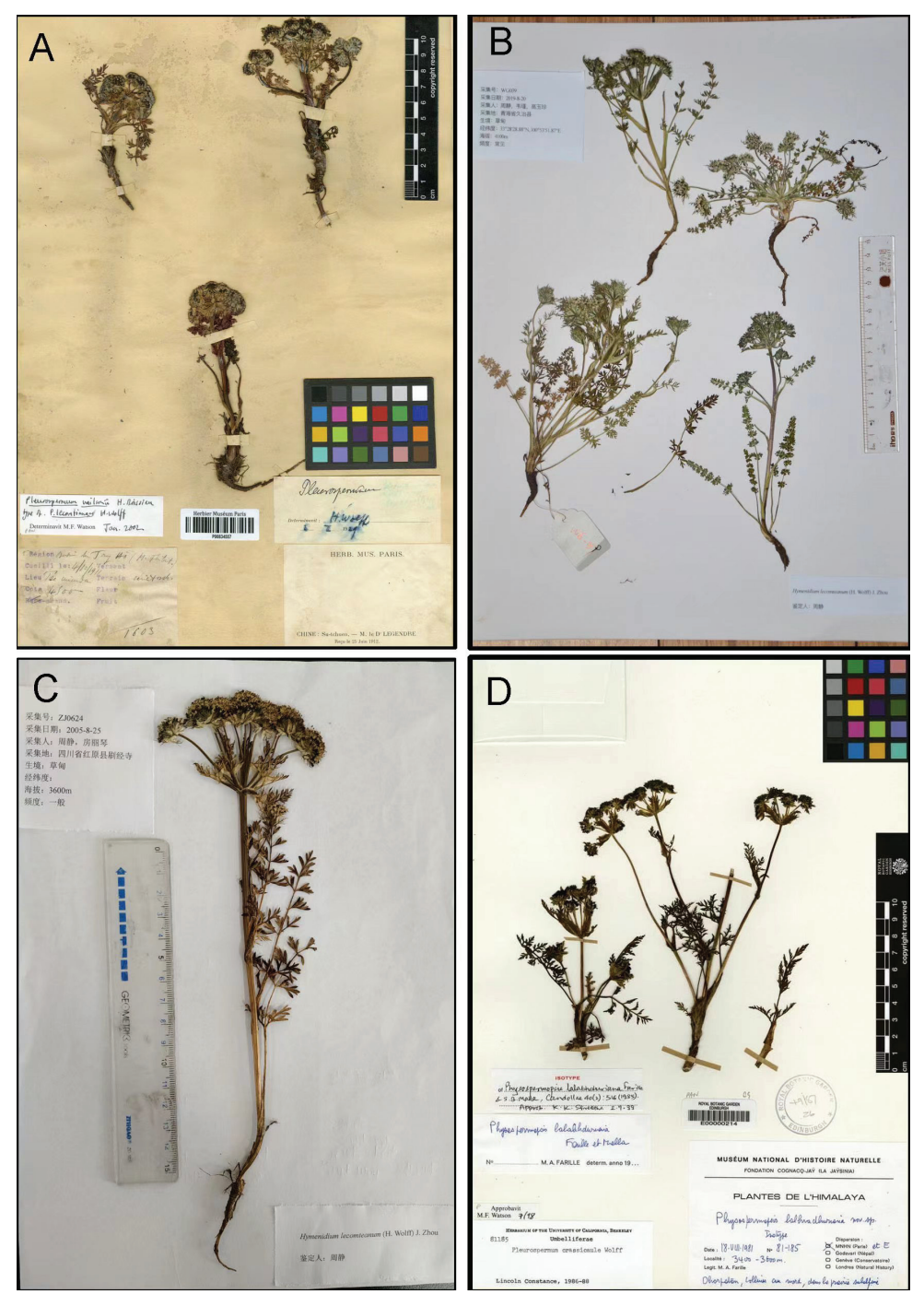
Figure 2. A syntype of Pleurospermum lecomteanum from P (P00834557) B the voucher specimen of P. lecomteanum from WG039 C the voucher specimen of P. lecomteanum from ZJ0624 D isotype of Physospermopsis lalabhduriana from E (E00000214).