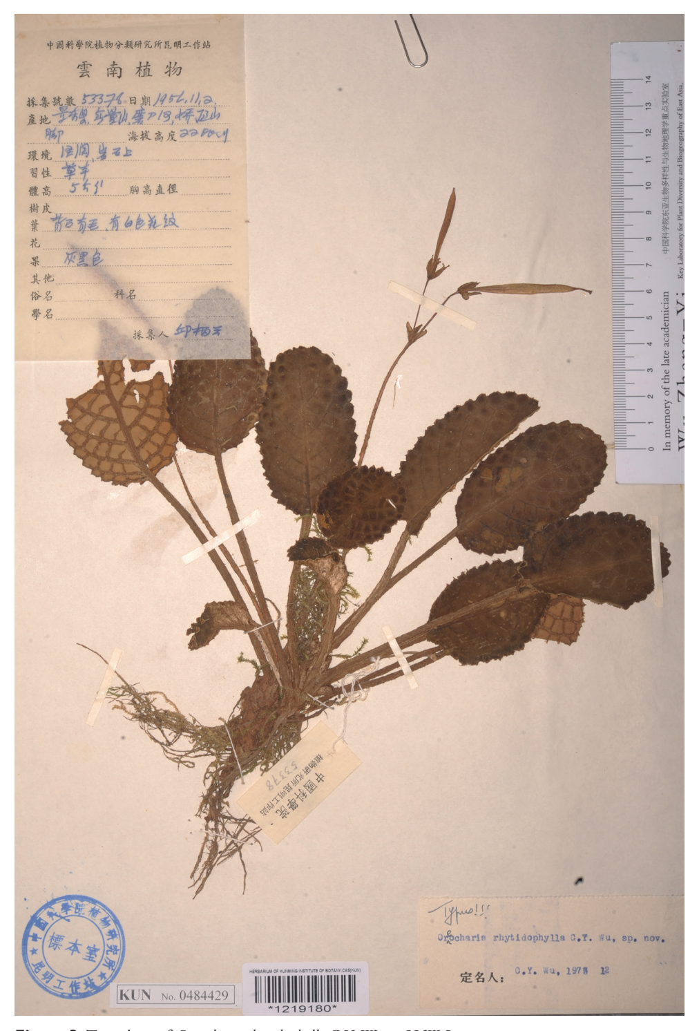
Figure 3. Type sheet of Oreocharis rhytidophylla C.Y. Wu ex H.W. Li.