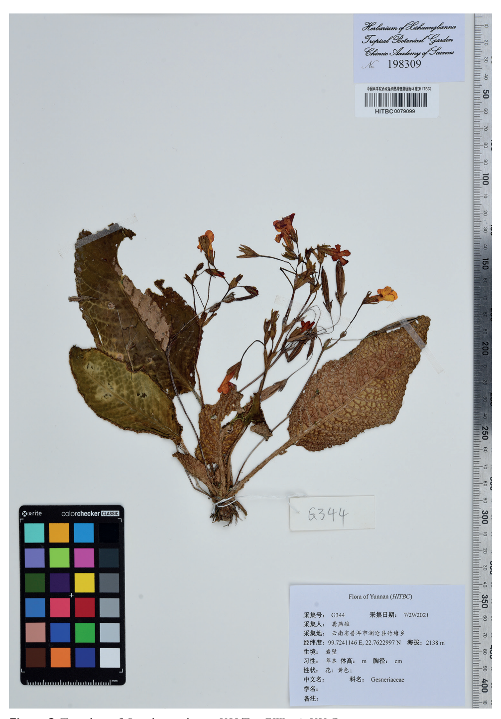
Figure 2. Type sheet of Oreocharis polyneura Y.H.Tan, F.Wen & Y.X.Gong, sp. nov.