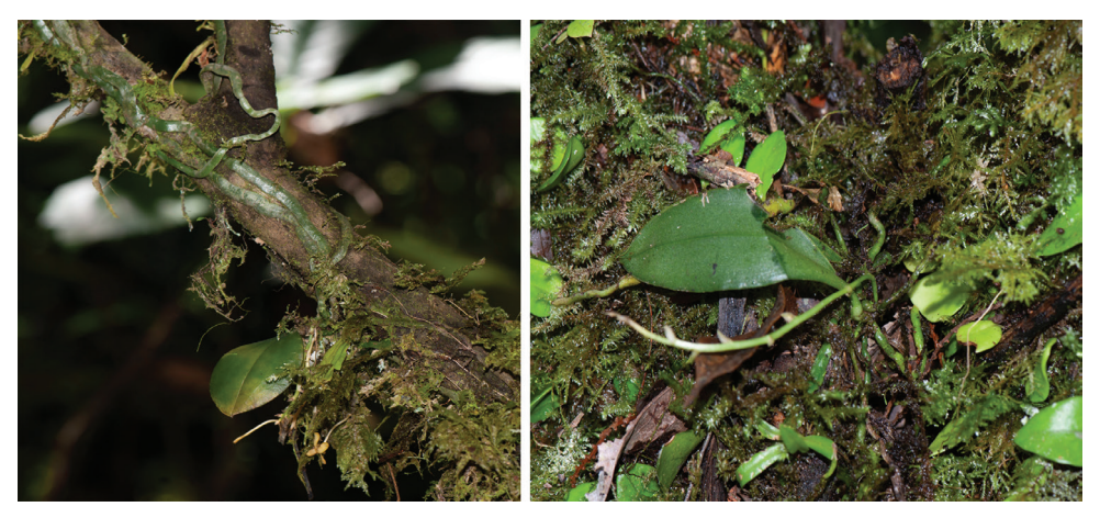
Figure 3. Habitat and plants of Phalaenopsis medogensis .

with a deep purplish-red spot in their lower part and hairy and pale yellow with dense rust-coloured spots in their upper part, and a rhombic mid-lobe with a fleshy horned appendage at base and grooved in the centre (Table 1).