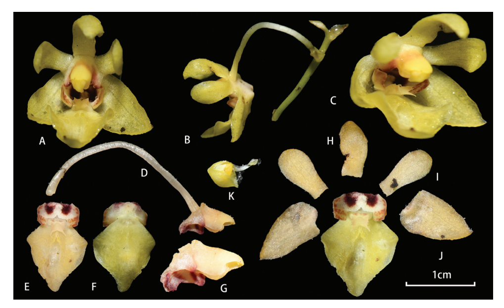
Figure 4. Flowers of Phalaenopsis medogensis X.H. Jin & C.B. Ma, sp. nov. A front view of flower B lateral view of flower C front view of flower, showing basal part of lip D lateral view of column, ovary and pedicel E lip, side view F lip, dorsal view G column and column foot H dorsal sepal I petal J lateral sepal K anther cap.

Epiphytic plant. Roots greenish, elongate, flattened, densely verrucose and prostrate along the twigs or trunk. Stem very short. Leaf 1, oblong-elliptic, 7-10 \times 3-4 cm. Inflorescences 1 or 2, suberect or arching, ca.12 cm long, unbranched, laxly 5–6 flowered; floral bracts ovate-triangular, 5–6 mm long. Flowers 1–1.2 cm in diameter,