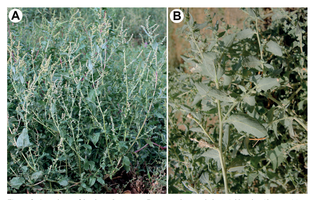
Figure 2. General view of the plants: A A. tatarica B A. rosea. Photographs by A. Sukhorukov ( A Russia, Tambov Oblast, Uvarovo, 20 September 2008) and M. Chambouleyron ( B Morocco, Jerada, 23 August 2019).

Contrary to A. sibirica and A. tatarica , the secondary range of A. rosea (Fig. 2B) in Eastern Europe has dramatically declined (Sukhorukov 2006). Almost all the recent claims about its wide distribution in the central and south parts of European Russia are erroneous, and since the 1930s there were no new records of A. rosea except the oc-