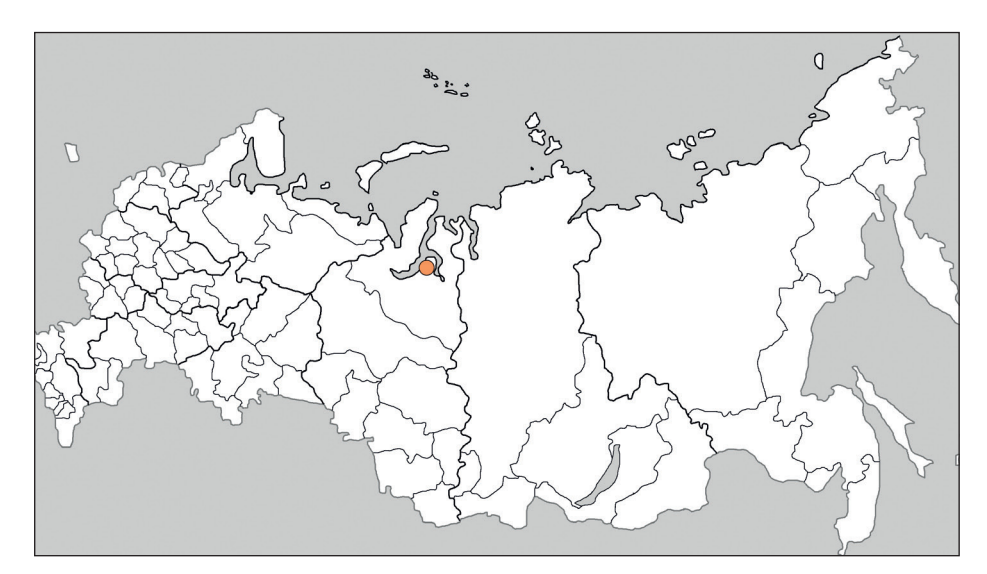
Figure 4. The location of a single alien record of Atriplex flabellum in Russia.

Taxonomy. The phylogenetic position of A. flabellum is distant to both A. sect. Obione and A. sect. Obionopsis ; this species belongs to the basal grade within a large clade encompassing the majority of the Old World species of the genus (Žerdoner Čalasan et al. 2022). It was assigned to A. subgen. Pterotheca (Aellen) Sukhor. (lecto-type species: A. moneta Bunge (Sukhorukov 2006)), whose monophyly has not been confirmed, and the sectional placement of A. flabellum has not been evaluated. A new classification of Atriplex is currently in preparation by Sukhorukov et al.