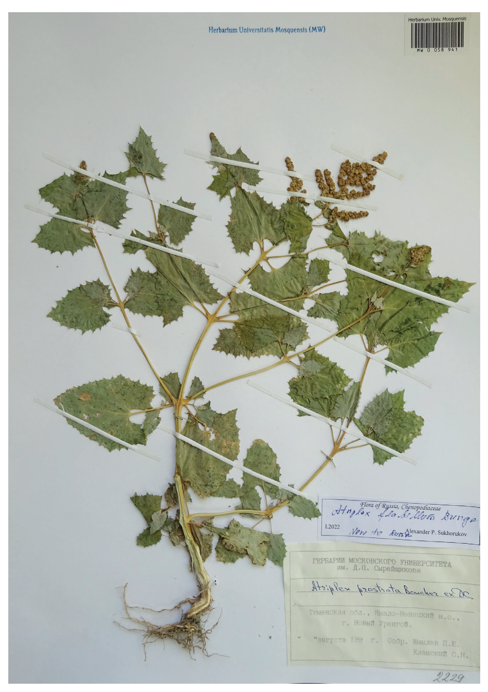
Figure 3. The voucher specimen of Atriplex flabellum recorded in Russia.