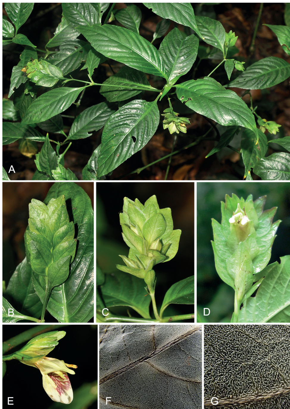
Figure 1. Photographs of Rungia fangdingiana sp. nov. A habit B spike (abaxial view showing the sterile bracts) C spike (adaxial view showing the fertile bracts and fruits) D spike (adaxial view showing the fertile bracts and corolla) E corolla F, G adaxial view of leaf blade (showing the linear cystoliths) A–E by Yun-Hong Tan, F, G by Zhe-Li Lin.