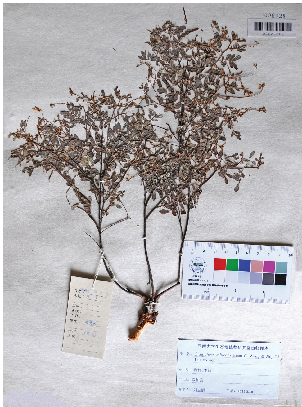
Figure 4. A specimen (YUKU-02024801) of Indigofera vallicola Huan C. Wang & Jin L. Liu sp. nov. collected in October 1965 from Ainishan village in Shuangbai County, southwest China.

Distribution and ecology. Indigofera vallicola is endemic to southwest China, where it has only been collected from two localities (ca. 45 km apart from each other) in central Yunnan to date: Xiao Luzhi (type locality) in Luzhijiang valley and Ainishan