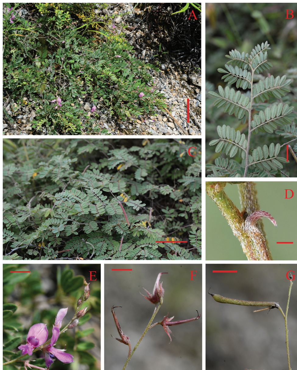
Figure 2. Indigofera vallicola Huan C. Wang & Jin L. Liu sp. nov. A habit B a portion of branchlet showing abaxial surfaces of leaflets C plants in fruiting stage D stipules E a portion of inflorescences F calyxes G legume. Scale bars: 10 cm ( A ); 4 cm ( C ); 1 cm ( B , G ); 4 mm ( E ); 3 mm ( F ); 1 mm ( D ).

brown medifixed symmetrically 2-branched trichomes; terminal leaflets obovate, apex rounded to truncate, and mucronate, base cuneate; lateral leaflets oblong or elliptic, apex rounded to truncate and mucronate, base rounded. Inflorescences racemose, axillary, 2.5–6 cm long. Peduncles 1–1.8 cm long. Bracts caducous, lanceolate to