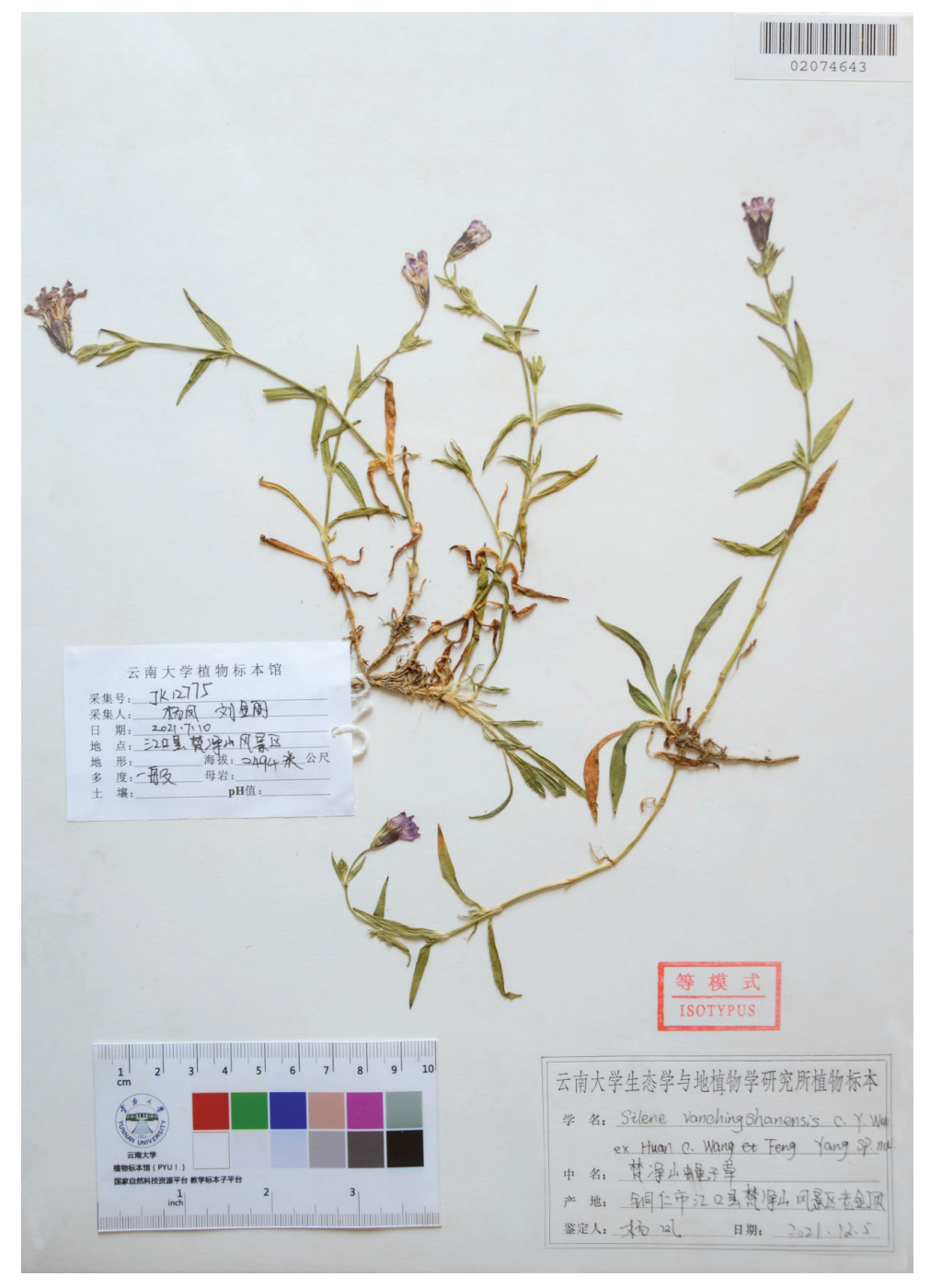
Figure 3. An isotype of Silene vanchingshanensis (YUKU 02074643).