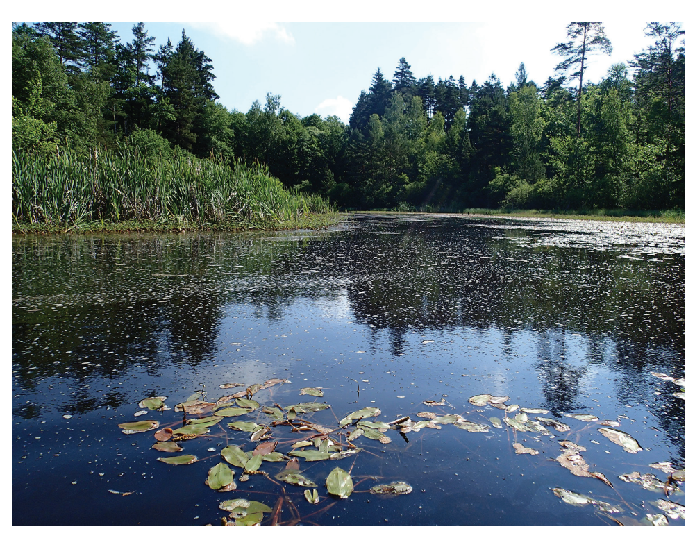
Figure 2. Photograph of a free water surface with knotweed ( Potamogeton sp., at the front) and Carex spp., together with Sphagnum spp. communities (left).