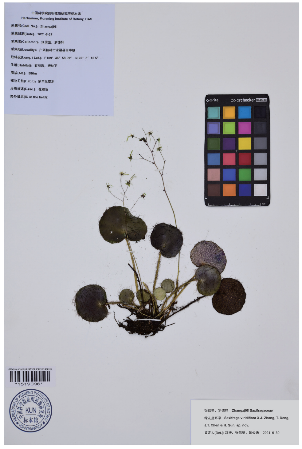
Figure 2. Photograph of the holotype of Saxifraga viridiflora X.J.Zhang, T.Deng, J.T.Chen & H.Sun, sp. nov. (Zhangx98, KUN1519096).