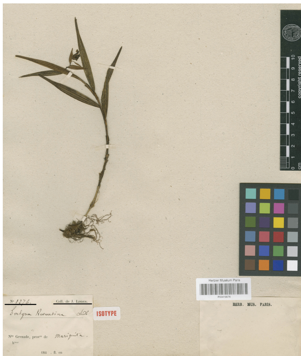
Figure 6. Evelynia kermesina Lindl. Specimen Linden 1276 at the Museum National d'Histoire Naturelle, Paris (P00419576) designated here as lectotype (CC BY 4.0; http://coldb.mnhn.fr/catalognumber/mnhn/p/p00419576 ).

to Evelynia lupulina Lindl. In such a situation, the lectotype may be designated from amongst these specimens. However, Garay (1978), in Flora of Ecuador , used the term type for the K specimen, while it can serve as the lectotype. According to Art. 9.10 of the Code of Nomenclature (Turland et al. 2018), Garay unknowingly designated a lectotype. A misused term may be corrected because this case meets the requirements of Art. 7.11 (Turland et al. 2018).