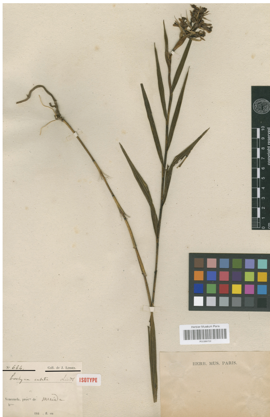
Figure 4. Evelynia ensata Lindl. Specimen Linden 664 at the Museum National d'Histoire Naturelle, Paris (P00389702), designated here as lectotype (CC BY 4.0; http://coldb.mnhn.fr/catalognumber/mnhn/p/p00389702 ).