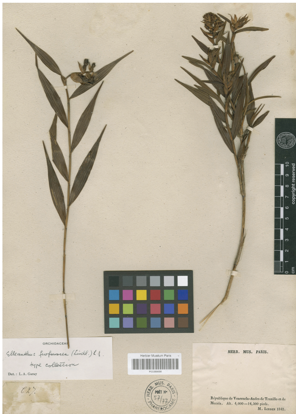
Figure 5. Evelynia furfuracea Lindl. Specimen Linden 627 at the Museum National d'Histoire Naturelle, Paris (P00389698) designated here as lectotype (CC BY 4.0; http://coldb.mnhn.fr/catalognumber/mnhn/p/p00389698 ).