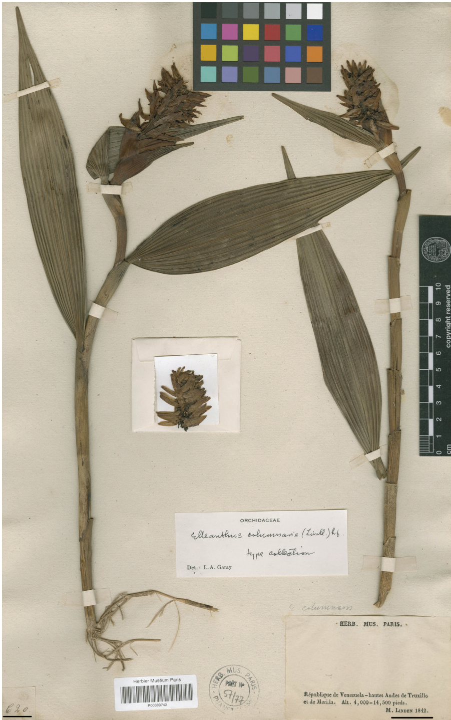
Figure 2. Evelyna columnaris Lindl. Specimen Linden 620 at the Museum National d'Histoire Naturelle, Paris (P00389742) designated here as lectotype (CC BY 4.0; http://coldb.mnhn.fr/catalognumber/mnhn/p/p00389742 ).