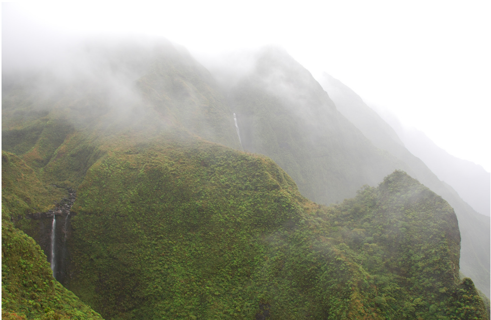
Figure 2. Landscape habitat where Coprosma kawaikiniensis was discovered below Kawaikini, Kaua'i, showing rugged terrain and the Dubautia-Sadleria shrubland-fernland (DSSF) community.

Kaulf., S. pallida Hook. & Arn., S. souleyetiana (Gaudich.) T.Moore, and occasionally S. squarrosa (Gaudich.) T.Moore.