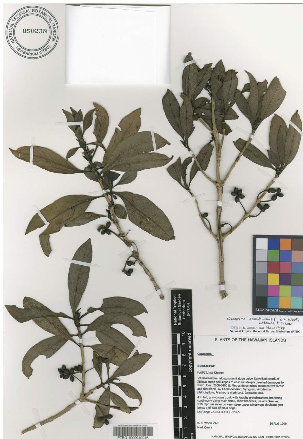
Figure 1. Coprosma kawaikiniensis K.R.Wood, Lorence & Kiehn, sp. nov. (holotype: PTBG).