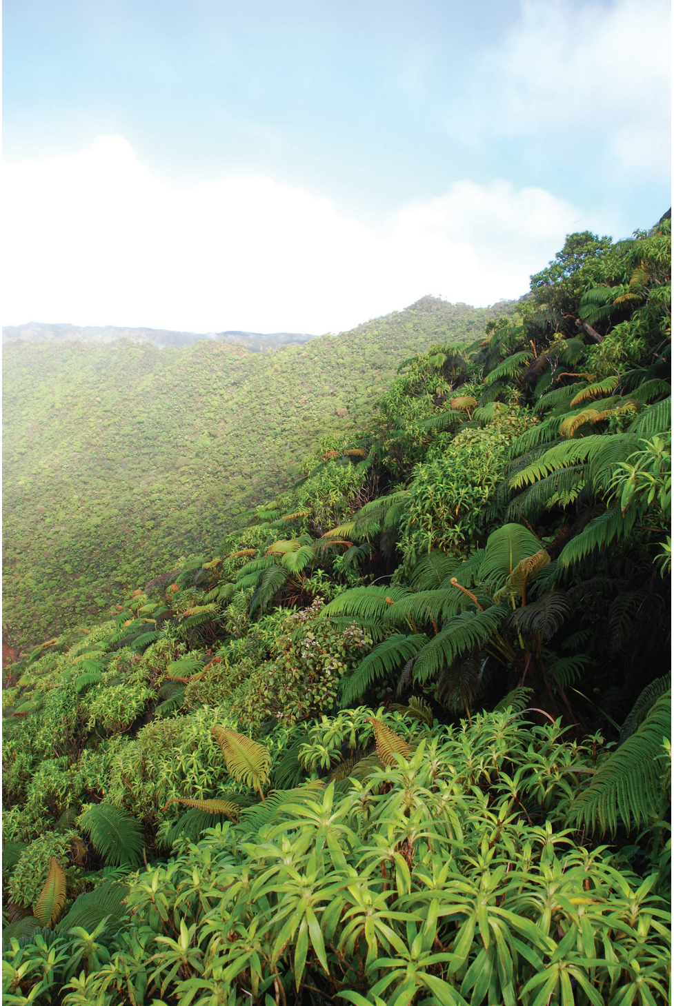
Figure 3. The Dubautia-Sadleria shrubland-fernland (DSSF) community below Kawaikini, Kauaʻi.