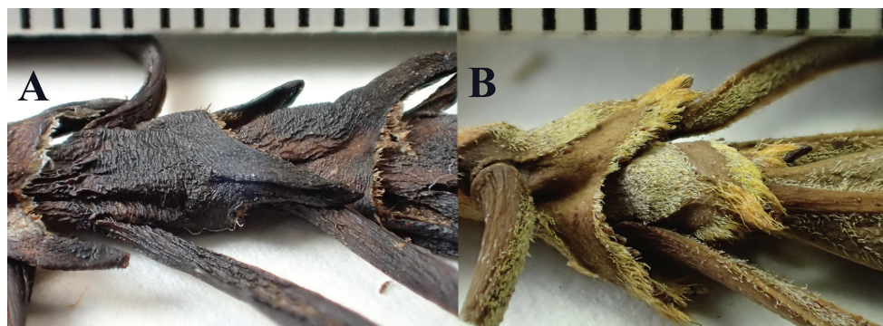
Figure 5. Stipules and petiole bases of Coprosma kawaikiniensis ( A Wood 3539, paratype PTBG) and C. kauensis ( B Perlman 18645, PTBG). Scale bars in mm.

claw-like appendage and occasionally a few short, rounded appendages or callous protuberances 0.1–0.2 mm long c. equaling the ciliate marginal hairs in C. kawaikiniensis , vs. (3–)5–7(–8) pairs of thickly ovoid to digitate, shiny dark brown-black marginal appendages 0.3–0.5 mm long in C. kauensis ] (Figure 5).