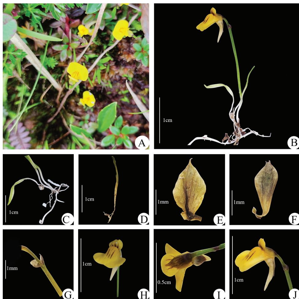
Figure 2. Utricularia libengiae (A–J) A habitat B whole plant C traps and laminar leaves D leaf E calyx upper lobe F calyx lower lobe G bracts H–J frontal, dorsal and lateral view of the flower (A–J) Photos by Z. Cheng.).

Type. CHINA, Yunnan Province, Nujiang Lisu Autonomous Prefecture, Gongshan Dulong and Nu Autonomous County, Dulongjiang Township, 2844 m a.s.l., 27°50'36"N, 98°27'48"E, 3 September, 2019, Chun Lin Long & Zhuo Cheng DXH066 , (holotype: KUN!; isotype: KUN!).