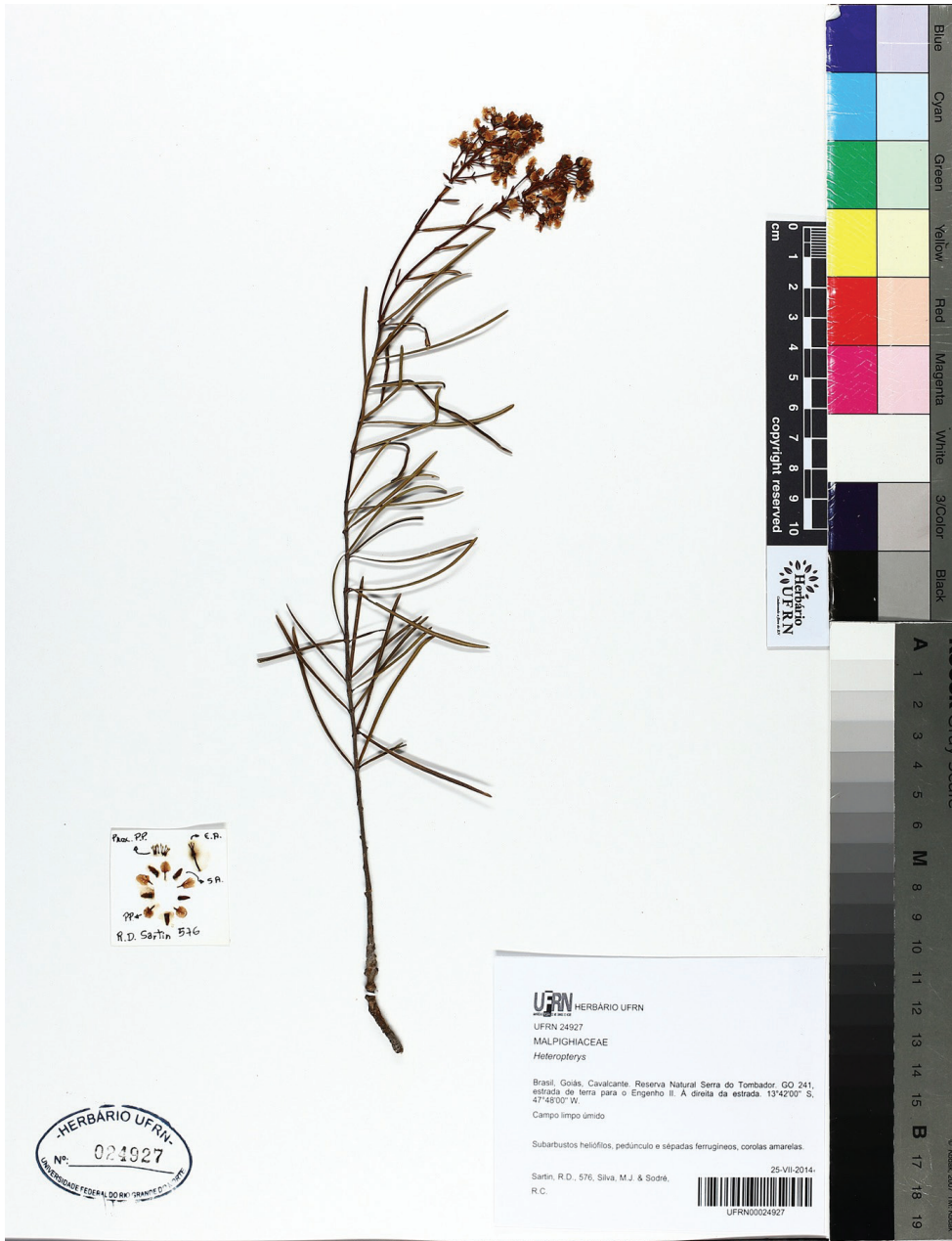
Figure 2. Holotype of Heteropterys rosmarinifolia R.F.Almeida & M.Pell. (R. Sartin et al. 576, UFRN barcode 00024927).

Paratype. BRAZIL. Goiás: Cavalcante, Reserva Natural Serra do Tombador, caminho para a cachoeira da Ave Maria, ponto onde se vê a cachoeira, 13°44'26"S, 46°52'46"W, 22 Sep 2015, fl., L. Rocha et al. 668 (HUEFS barcode HUEFS000273192!).