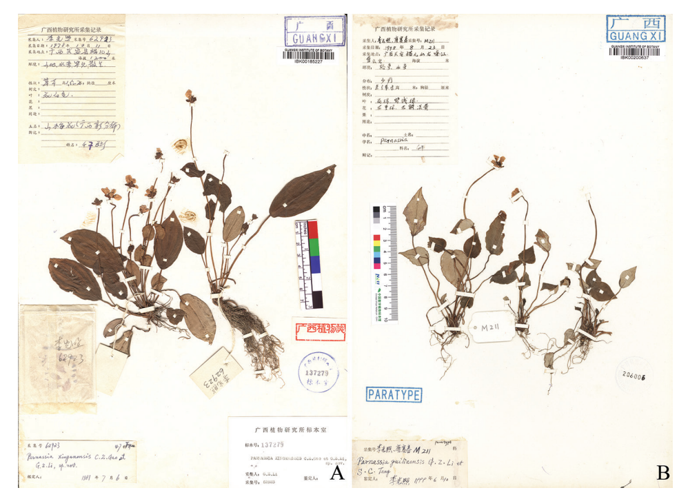
Figure 1. Type specimens of Parnassia xinganensis (A) and P. guilinensis (B).

Type. CHINA. Guangxi: Guilin City, Xing'an County, Mao'er Mountain, streamsides in valleys, alt. 1200 m, 11 December 1978, G.Z.Li 62923 (holotype: IBK00185227!; isotype: IBK00200466!).