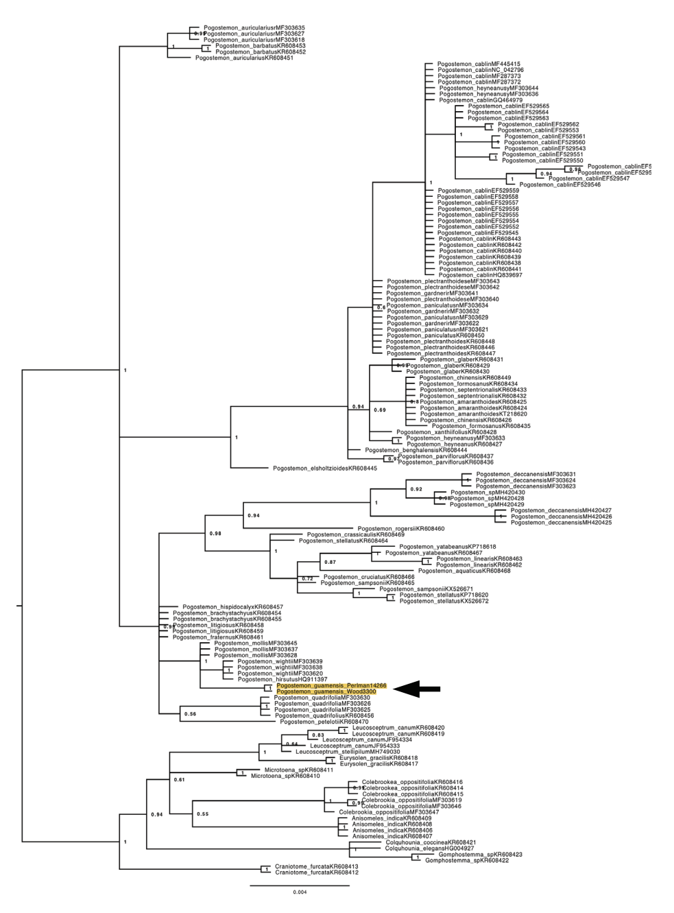
Figure 1. A phylogenetic reconstruction of genus Pogostemon estimated using Baysean Inference of partial matK sequences generated in this study and obtained from GenBank. Node labels indicate posterior probabilities. Based on matK evidence, a well-supported clade containing P. guamensis , P. hirsutus , P. wightii , and P. mollis is separate from that containing P. cablin , the common patchouli plant with a broad feral distribution and superficial resemblance to P. guamensis . Arrow and highlighting indicate samples of P. guamensis .