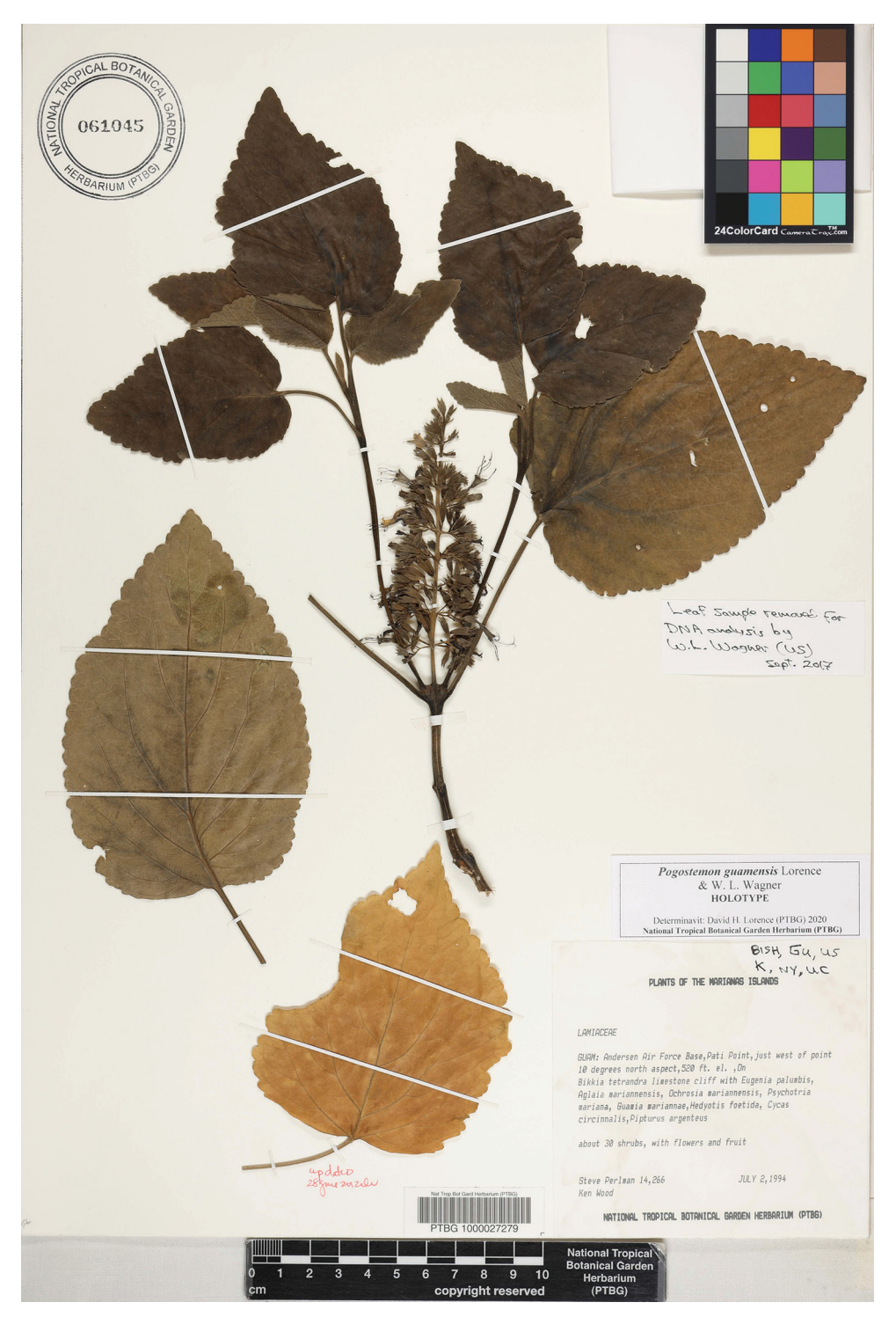
Figure 3. Pogostemon guamensis Lorence and W.L. Wagner (Perlman & Wood 14266, holotype PTBG-061045).