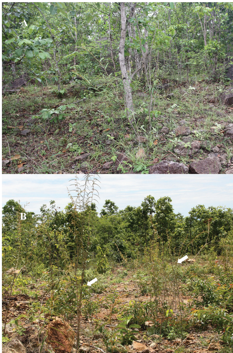
Figure 2. Habitat and habit of Helicteres binhthuanensis A habitat B habit.