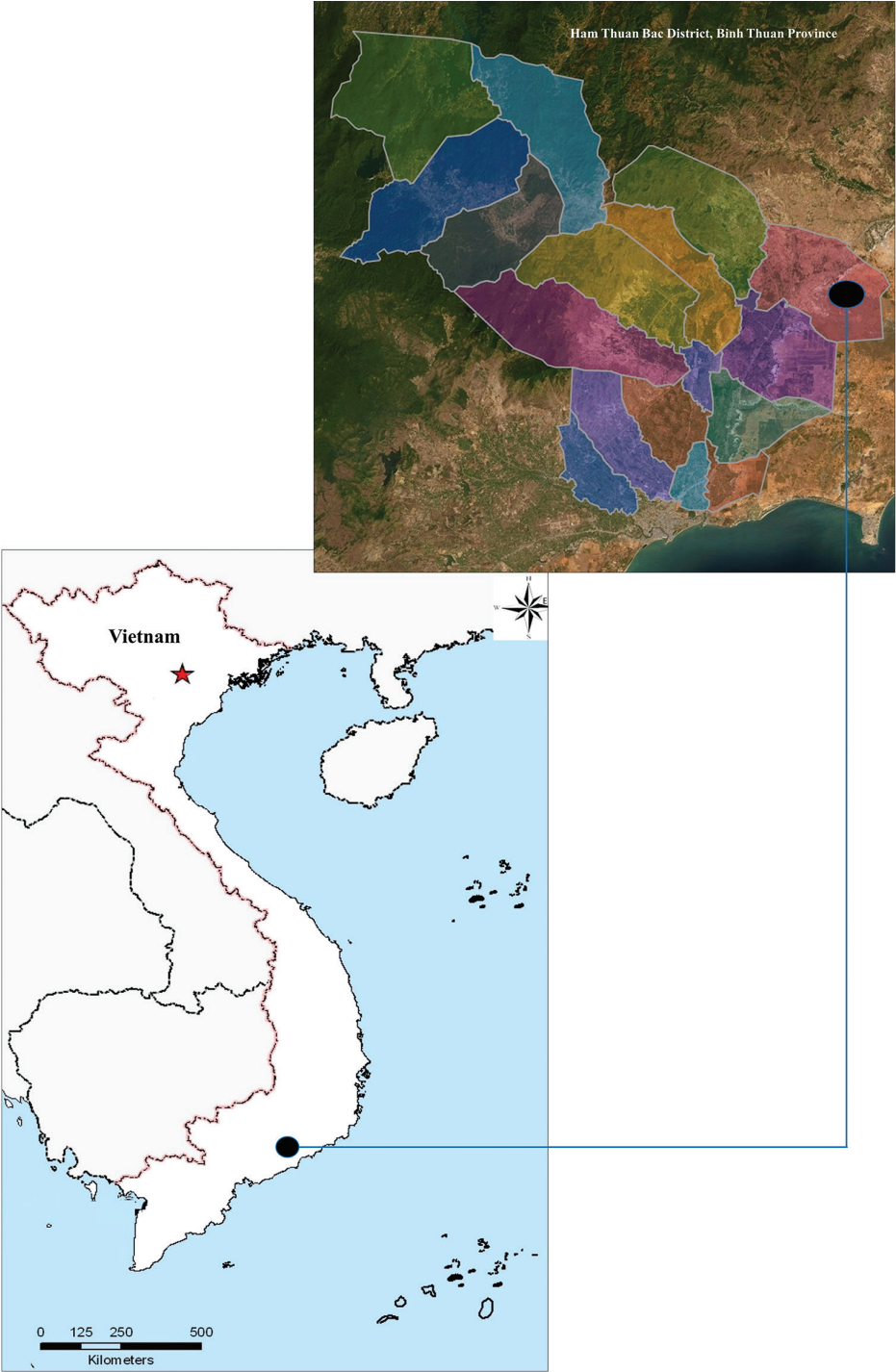
Figure 1. Type locality of Helicteres binhthuanensis .