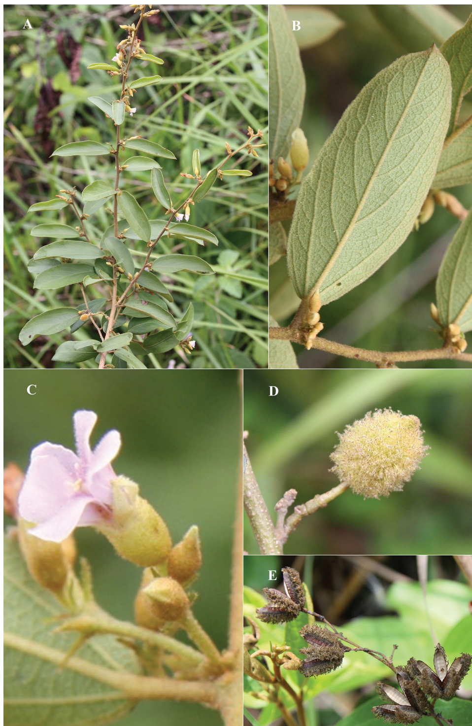
Figure 4. Helicteres angustifolia A flowering branches B abaxial leaf surfaces C close-up of axillary inflorescence and flowers D, E close-up of fruits.