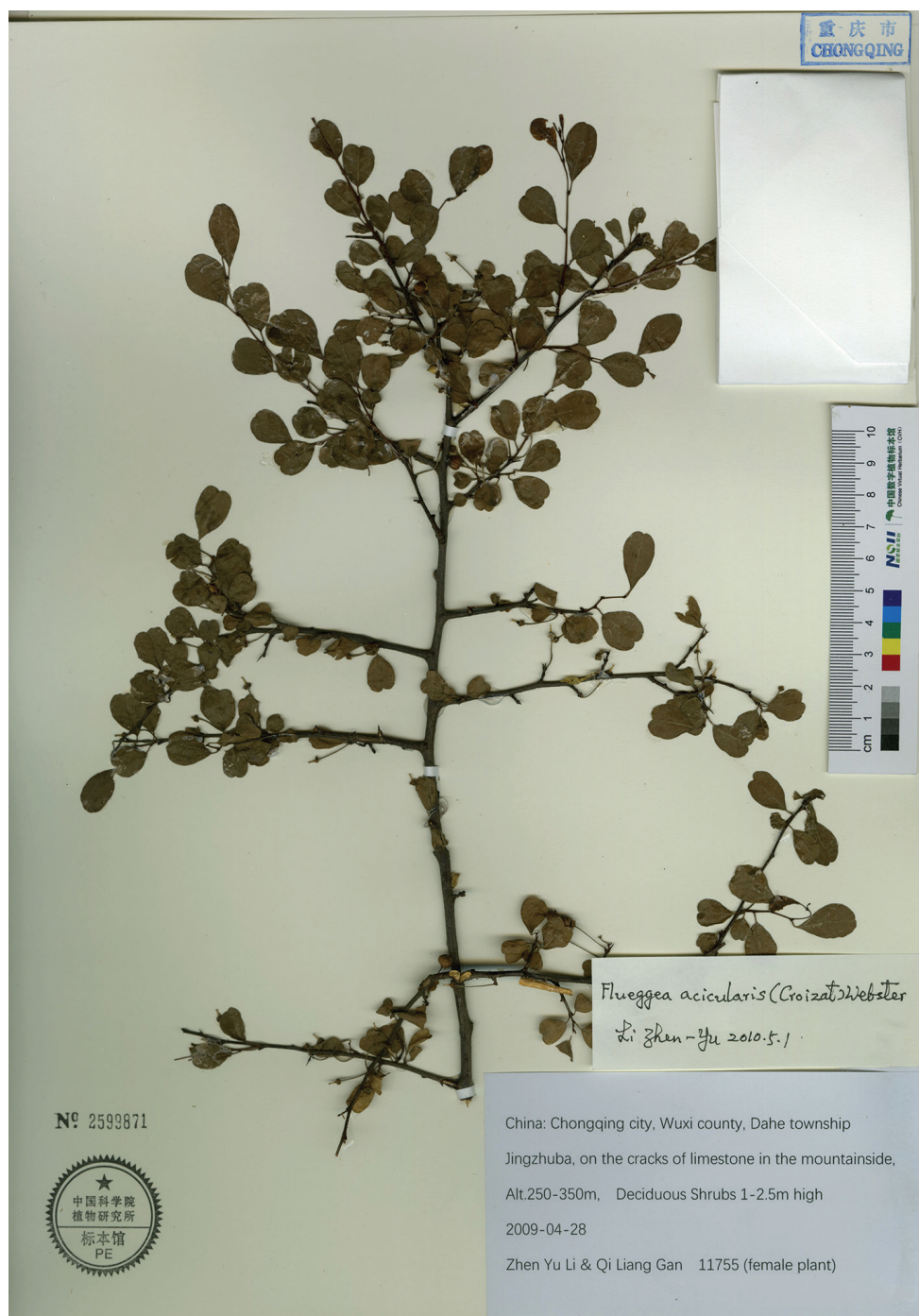
Figure 1. Flueggea acicularis (Croizat) Webster. (fruiting specimen, Z. Y. Li & Q. L. Gan 11755, PE).