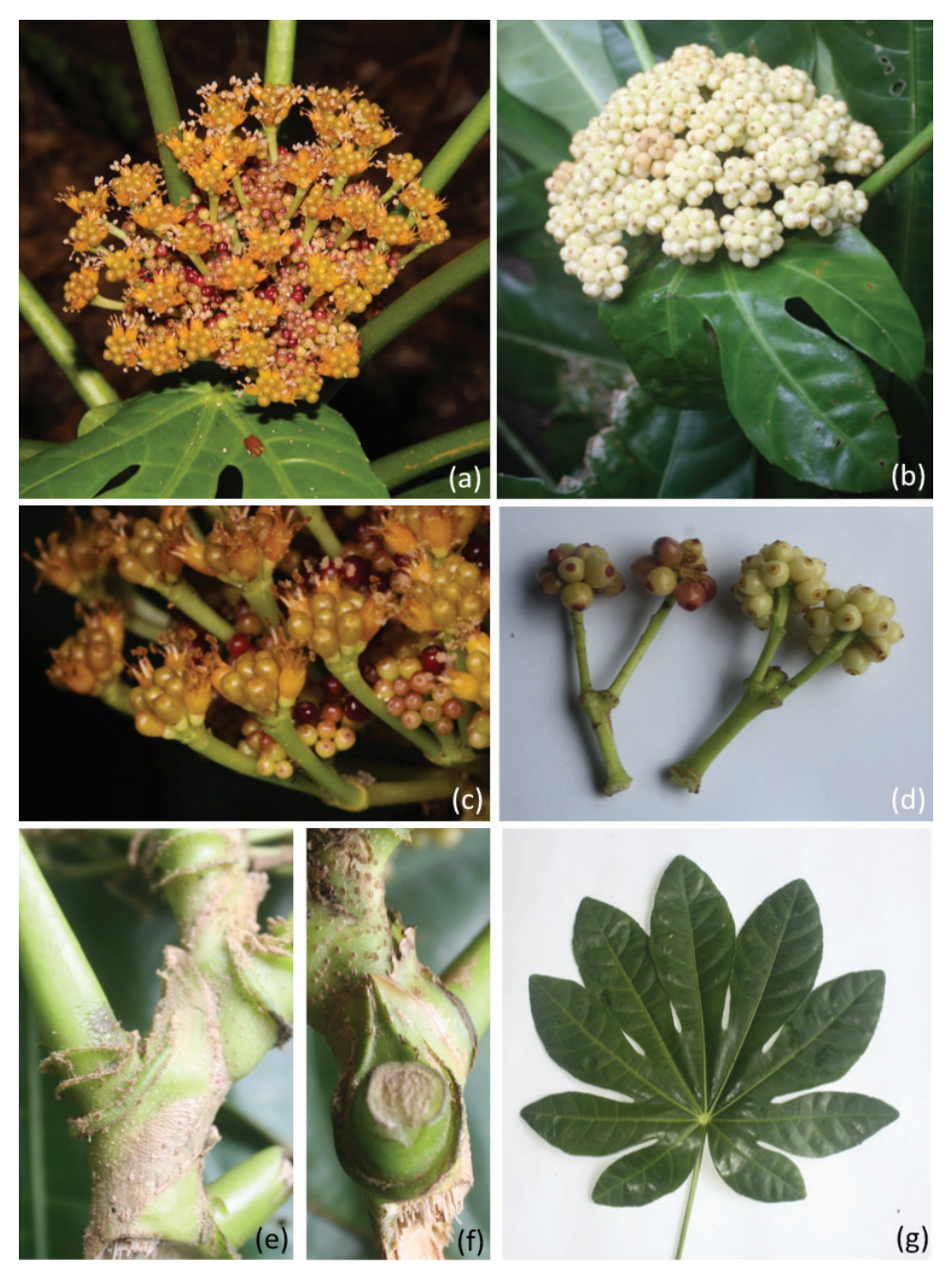
Figure 1. Osmoxylon leidechii a compound inflorescence with flowers b compound inflorescence with fruits c fertile flowers and sterile fruits d individual inflorescences with fruits e petiolar stipule side view and stipule crests f petiolar stipule overhead view g leaf.