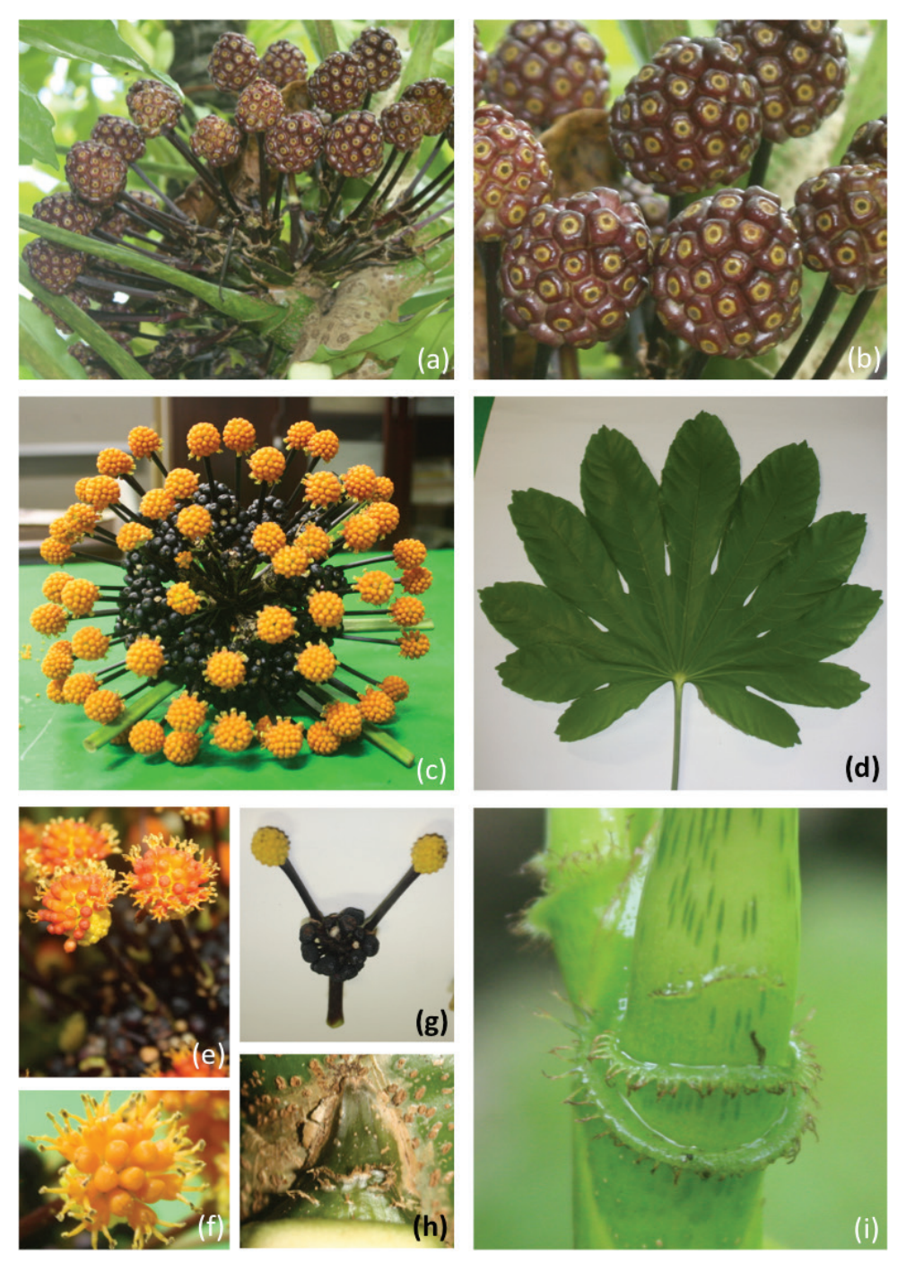
Figure 3. Osmoxylon truncatum \mathbf{a} compound infructescence with mature fruits \mathbf{b} mature fruits \mathbf{c} compound inflorescence with un-opened flowers \mathbf{d} mature leaf \mathbf{e} one mature inflorescence \mathbf{f} flower head \mathbf{g} one fertilized inflorescence, without corollas \mathbf{h} petiolar stipule \mathbf{i} petiole crests.