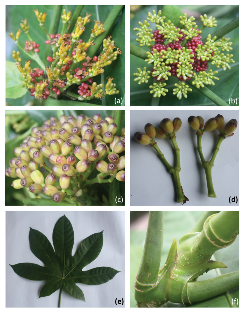
Figure 4. Osmoxylong pachyphyllum a compound inflorescence with mature flowers b compound inflorescence with immature flowers c compound inflorescence with mature fruits d two inflorescences with mature fruits e mature leaf f petiolar stipule and petiole crests.

gle; petiolar crests 1–2, rarely 3, firm with sharp edges, sparsely ciliate; stipules not appressed to stem, strongly recurved, glabrous, tip sharp to the touch. Inflorescence 7–15 cm in diameter, primary axis bearing 12–15 secondary inflorescence units, secondary