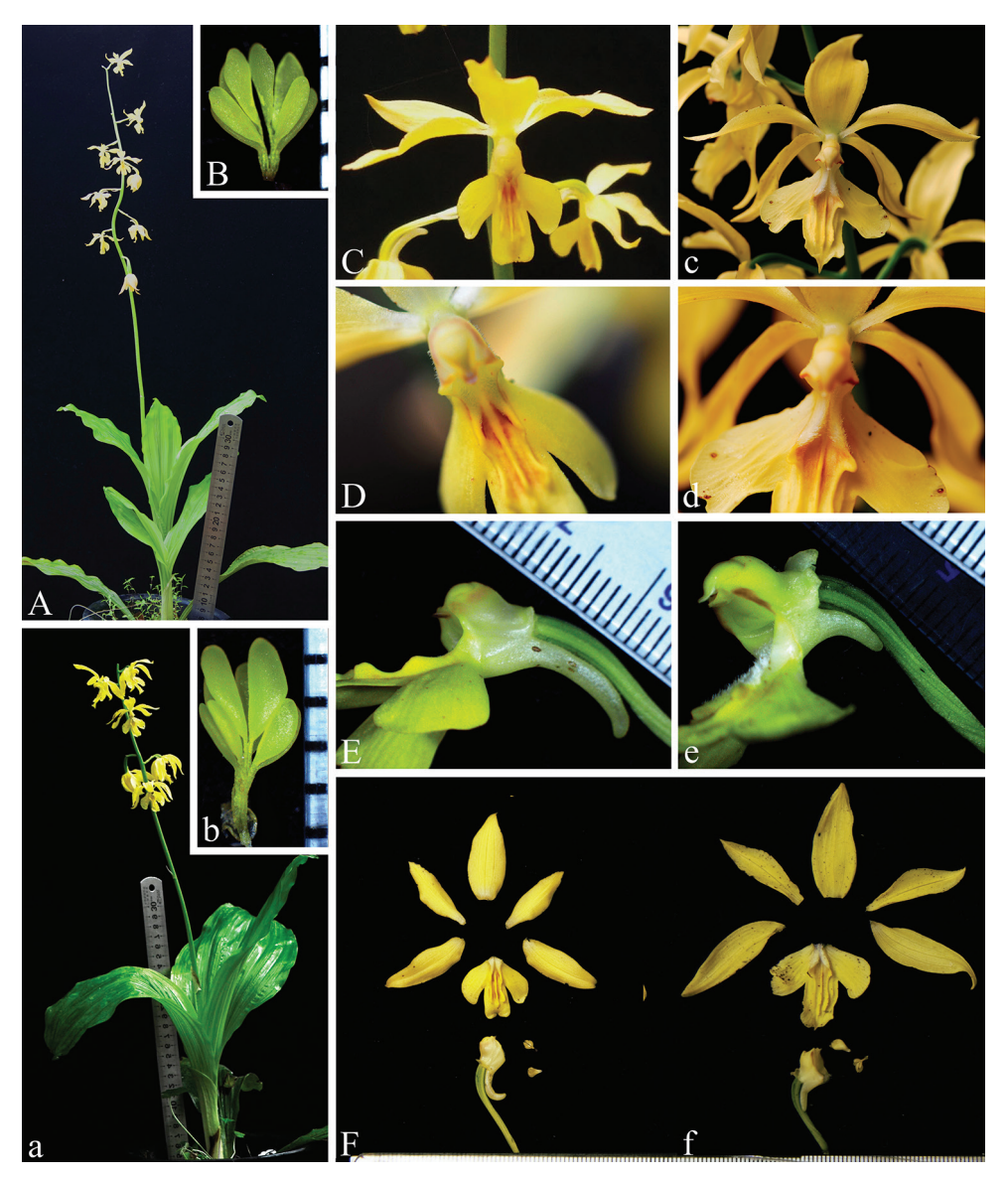
Figure 1. Morphological comparison between Calanthe sieboldopsis B.Y.Yang & Bo Li, sp. nov. ( A–F ) and C. sieboldii Decne. ex Regel ( a–f ) A , a habit B , b pollinia C , c flowers D , d column (top view) and base of lips E , e column (lateral view) and spur F , f dissection of a flower.

Mountains of Jiangxi Province and another in Xianyueshan Mountain of Liling City, Hunan Province (Figure 3). The two localities belong to the same large mountain range, Luoxiao Mountains, which are the provincial border of Jiangxi and Hunan provinces. Plants of both populations grow in wet valleys and near margins of evergreen broad-leaf forest at elevations of 400–600 m a.s.l.