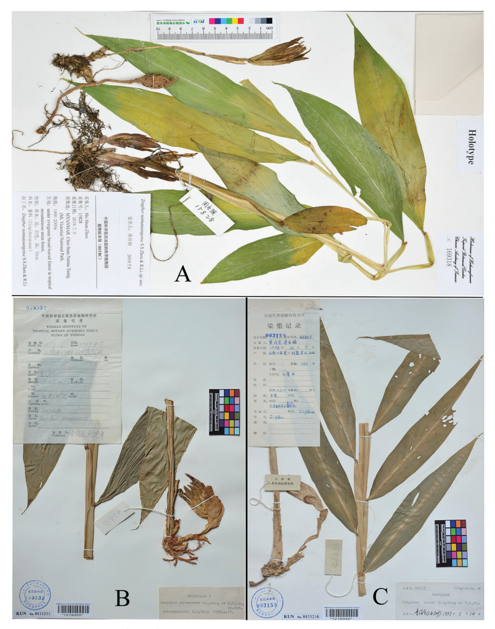
Figure 2. A Holotype of Zingiber natmataungense S.S.Zhou & R.Li, sp. nov (S.S. Zhou. 15828, HITBC Acc. No. 169318) B holotype of Z. yunnanense S.Q.Tong et X.Z.Liu (Tong, S.Q. & Liu, X.Z. 42412, KUN Acc. No. 0833231) C isotype of Z. teres S.Q.Tong et Y.M.Xia (Tong, S.Q. & Xia, Y.M. 42403, KUN Acc. No. 0833210).

Description. Pseudostems 50–80 cm, base with purplish-red sheaths. Rhizome yellow, aromatic. Leaves subsessile, ligule 2-lobed, 2-3 mm, sparsely pubescent; leaf blade green, abaxially light green, lanceolate or narrowly, ca. 5-25 \times 3-5 cm, glabrous,