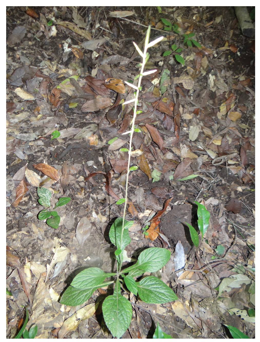
Figure 2. The whole plant Ainsliaea daheishanensis Y.L.Peng, C.X.Yang & Y.Luo, sp. nov. in its habitat (under evergreen forest).