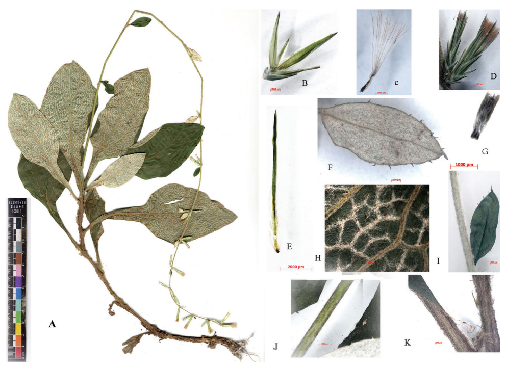
Figure 1. Ainsliaea daheishanensis Y.L. Peng, C.X. Yang & Y. Luo, sp. nov. A habit B involucres C pappus D inflorescences E inner phyllary F upper leaf G magnified achene H magnified abaxial surface of median part leaves of the stem I–J upper part of stem and leaves, respectively K lower part of the stem.

Etymology. The new specific epithet "daheishanensis" refers to the name of the Dahei Mountain, located at the border between China and Myanmar, where the novel species was discovered.