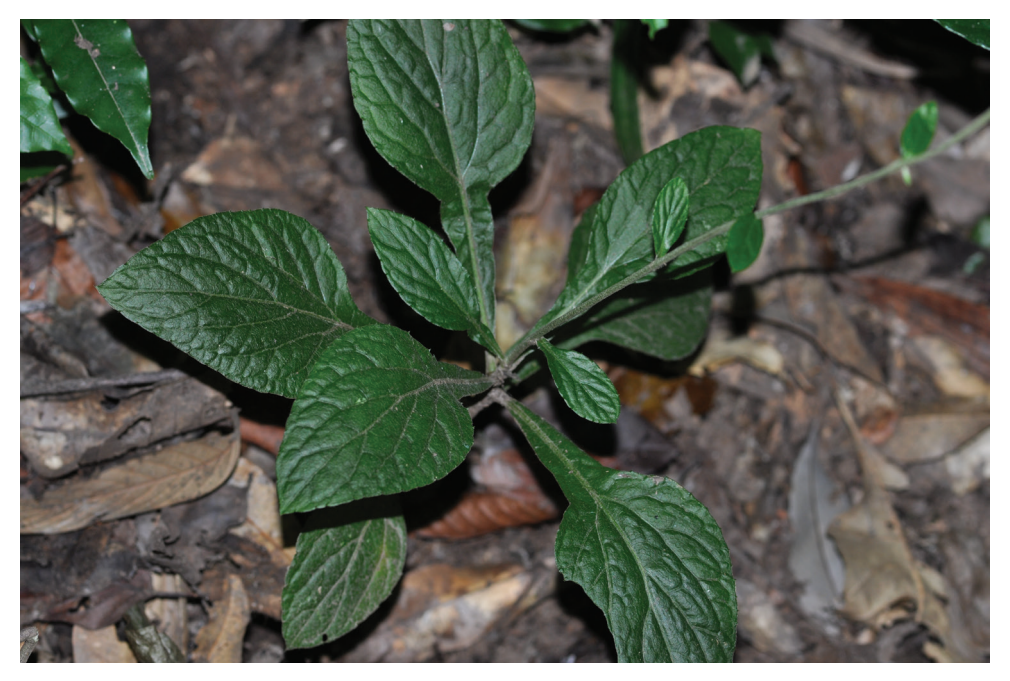
Figure 3. The lower part of the plant Ainsliaea daheishanensis Y.L.Peng, C.X.Yang & Y.Luo, sp. nov. in the field.