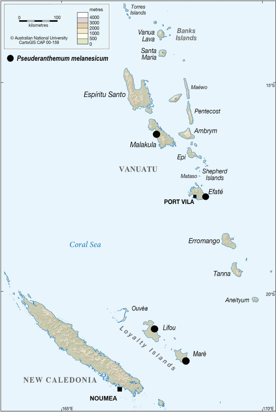
Figure 1. Distribution of Pseuderanthemum melanesicum Gâteblé, Ramon & Butaud, sp. nov. in some islands of New Caledonia and Vanuatu. Map done using CartoGIS Services, College of Asia and the Pacific, The Australian National University.