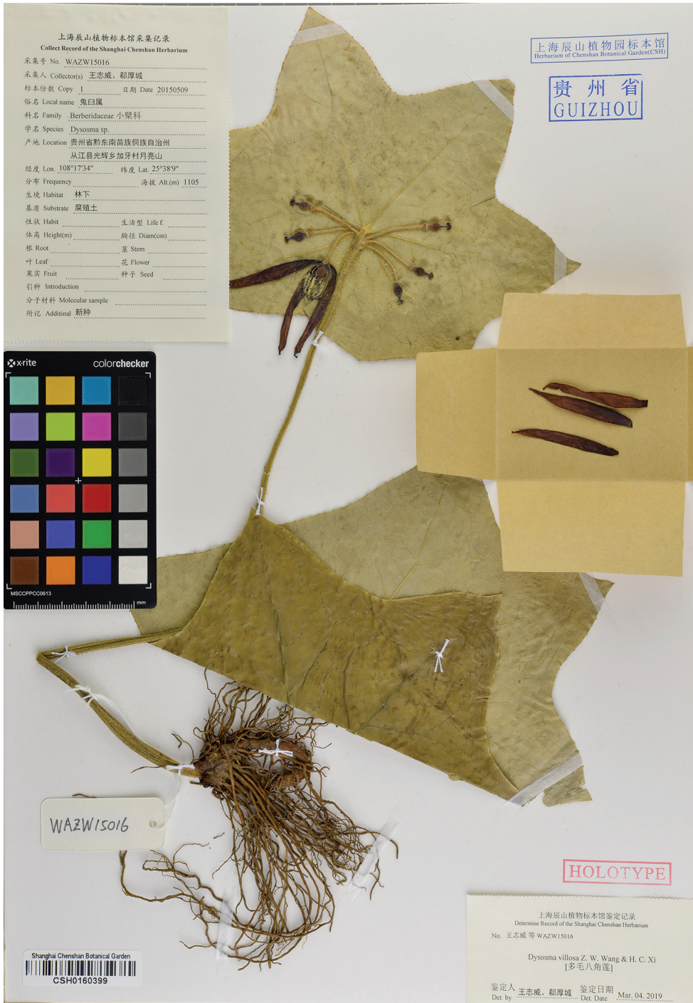
Figure 1. Holotype of Dysosma villosa Z.W.Wang & H.C.Xi.