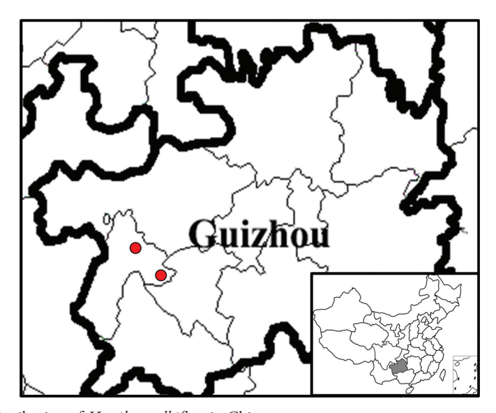
Figure 1. Distribution of Hemiboea albiflora in China.

Morphological observations and measurements of the new species were carried out, based on living plants and dry specimens (PE, QNUN and XIN). The photographs were taken in the field. All morphological characters were studied under dissecting microscopes and are described using the terminology presented by Wang et al. (1998).