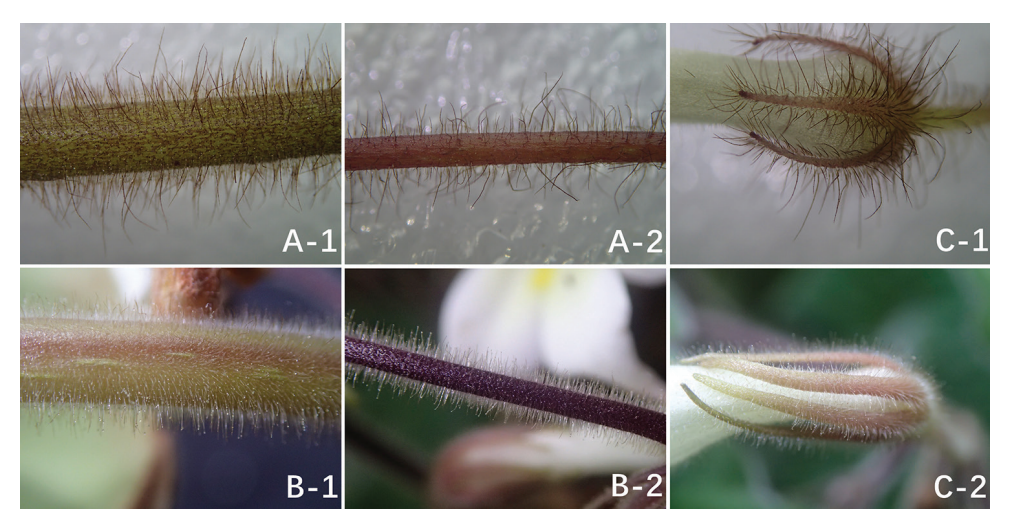
Figure 3. The difference of indumentum between Petrocodon rubiginosus Y.G.Wei & R.L.Zhang, sp. nov. ( A ) and Pet. hechiensis (Y.G.Wei, Yan Liu & F.Wen) Y.G.Wei & Mich.Möller ( B ): densely curly rubiginous to ferruginous villous on surface of petiole ( A–I ), pedicel ( A–2 ) and calyx lobes ( C–I ) and densely short glandular-pubescent and pubescent on surface of petiole ( B–I ), pedicel ( B–2 ) and calyx lobes ( C–2 ).