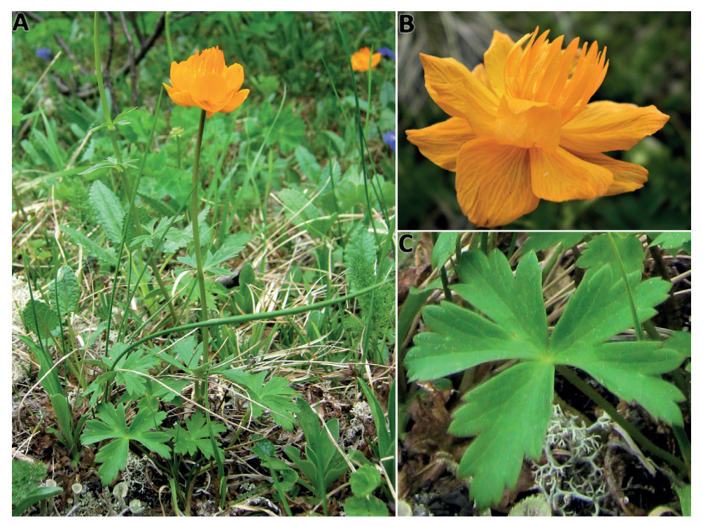
Figure 2. Photograph of Trollius austrosibiricus . A Flowering plant B Flower C Leaf laminae.

Jul 1980, M. Danilov & A. Krytsin 932 (NS barcode 0013096!); the northern slope of the East Tannu-Ola ridge, the average flow of Elegest river, floodplain, No., 22 Jul 1973, V. Khanminchun & V. Dyukov 2270 (NS barcode 0013095!); Kemerovo Oblast : Tashtagol region, the village of Ust-Kabyrza 4 km above Pysas river, 52°48'N, 88°28'E, 450 m alt., grass meadow, haymaking, 11 Sep 2000, I. M. Krasnoborov, A. I. Shmakov, D. Germann, S. Kostyukov, E. Antonuk, P. Kosachev & A. Vashchenko 207 (NS barcode 0013094!); Krasnoyarsk Krai : Abansky region, near Ustyanskoye village, the upper part of the eastern slope, upland meadow, 6 Jul 1956 T. Vagina (NS barcode 0013093!); Ermakovsky district, valley of the US river, elevation 852 m alt., 52.2847°N, 93.2517°E, 03 Jul 2010, I.V. Khan & E.A. Balde 152 (NSK barcode 0028601!); Khakassia Republic : Abansky ridge, near Biskamzha station, southern slope, burning, 53.25 N, 089.30E, 700 m alt., 4 Jun 1991, E. Ankipovich (NS barcode 0013092!).