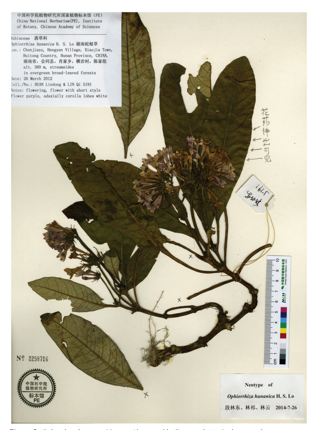
Figure 3. Ophiorrhiza hunanica . Neotype (designated by Duan et al. 2014), showing subterranean stem internodes 1–2 cm long and inflorescences 5- to many-flowered.