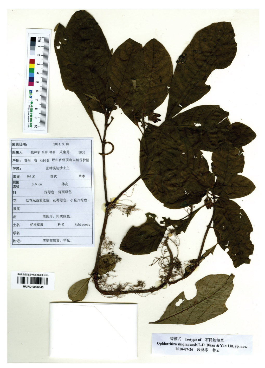
Figure 2. Ophiorrhiza shiqianensis. Isotype, showing subterranean stem internodes 5–10 cm long and inflorescences 2- to 10-flowered.