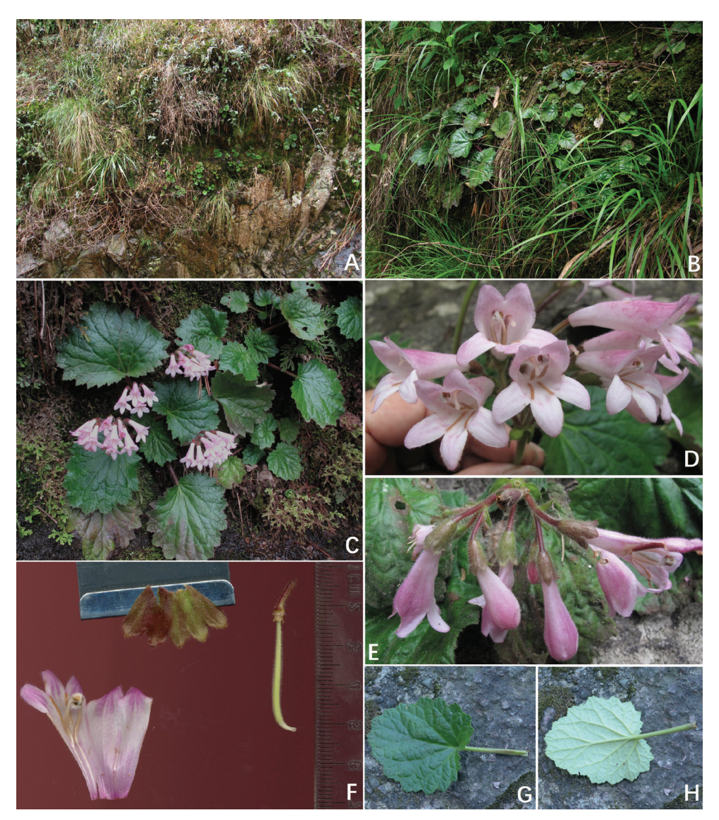
Figure 2. Didymocarpus lobulatus F. Wen, Xin Hong & W.Y. Xie. A Habitat B Vegetative part of plants C Habitat in flowering D Frontal view of corolla E Top view of cyme, showing actinomorphic calyx F Opened corolla for showing stamens, pistil and calyx lobes G Adaxial surface view of leaf blade H Abaxial surface view of leaf blade.

Distribution and habitat. Didymocarpus lobulatus is locally abundant and endemic to a narrow area in eastern China, surrounding the type locality. This species grows on moist shady cliffs of sandy shale hills, at an elevation of 223 m a.s.l. in type locality. The average temperature is 16.4 °C, the average annual precipitation has been calculated as ca. 1,446.8 mm. The forest is a subtropical monsoon climate evergreen