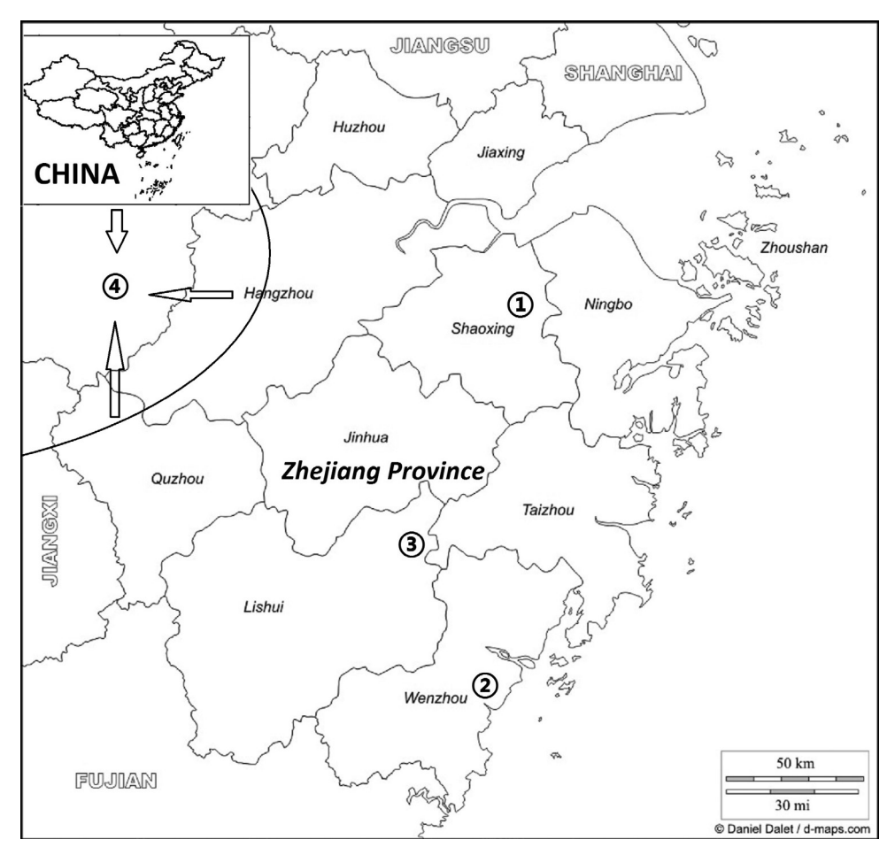
Map 1. The distribution areas of Didymocarpus lobulatus and its congeners in Zhejiang prov.: ① D. lobulatus ② D. cortusifolius ③ D. salviiflorus ④ D. heucherifolius (in semi-elliptical region, the arrows point).

broad-leaved forest. Flowering in May. Another population growing in the Danxia landscape of Chuanyanshijiufeng, Xinchang County, Shaoxing city, not far away from the type locality, was discovered by the first author in 2016. The two places are about 40 kilometres apart.