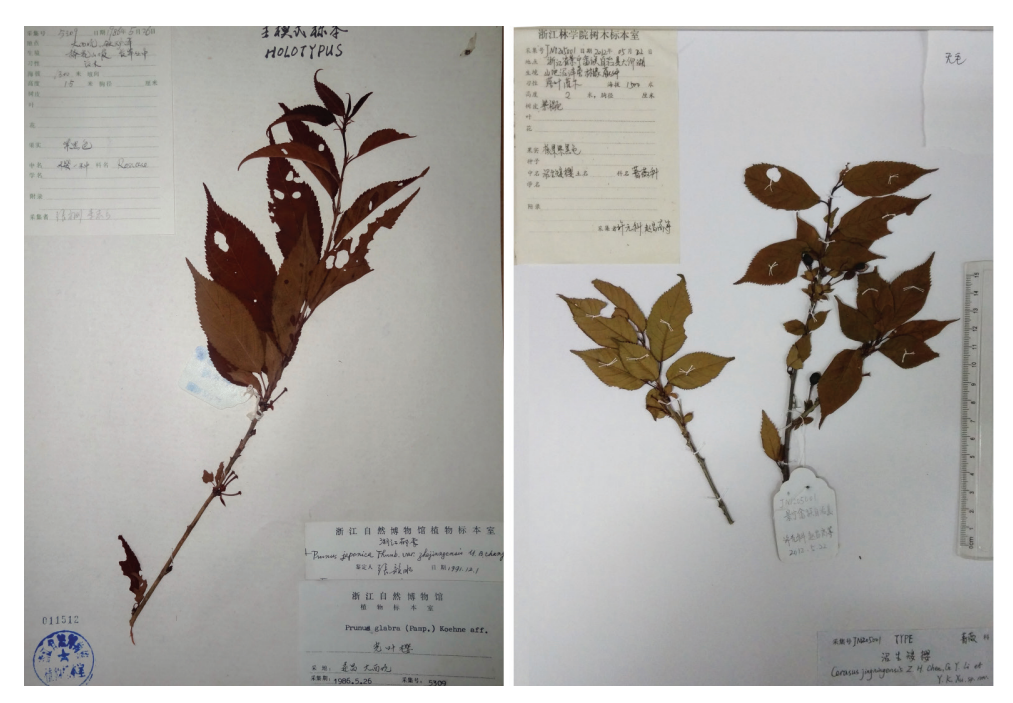
Figure 1. Holotypes of Prunus japonica var. zhejiangensis (left) and Cerasus jingningensis (right).

ZM (Chinese Academy of Sciences 2018, Thiers, [continuously updated].) were examined by visiting the herbaria or through the Chinese Virtual Herbarium (Chinese Academy of Sciences 2018) and Global Plant database (JSTOR 2018). To evaluate the differences between P. veitchii and P. serrulata var. pubescens , specimens from different origins were selected to gather morphological data and which were subjected to morphometric analyses. Seven floral characters and eight leaf characters (Table 1) were selected for analyses, following Chang et al. (2007), though some characters used by Chang et al. (2007) were discarded because it was not possible to collect enough relevant data from the available specimens. A total of 26 specimens for floral characters and 44 specimens for vegetative characters were measured (see Appendix 1). Measurements were made manually with rulers for borrowed specimens or performed using Digimizer version 4.6.0 (MedCalc Software 2018) for online images.