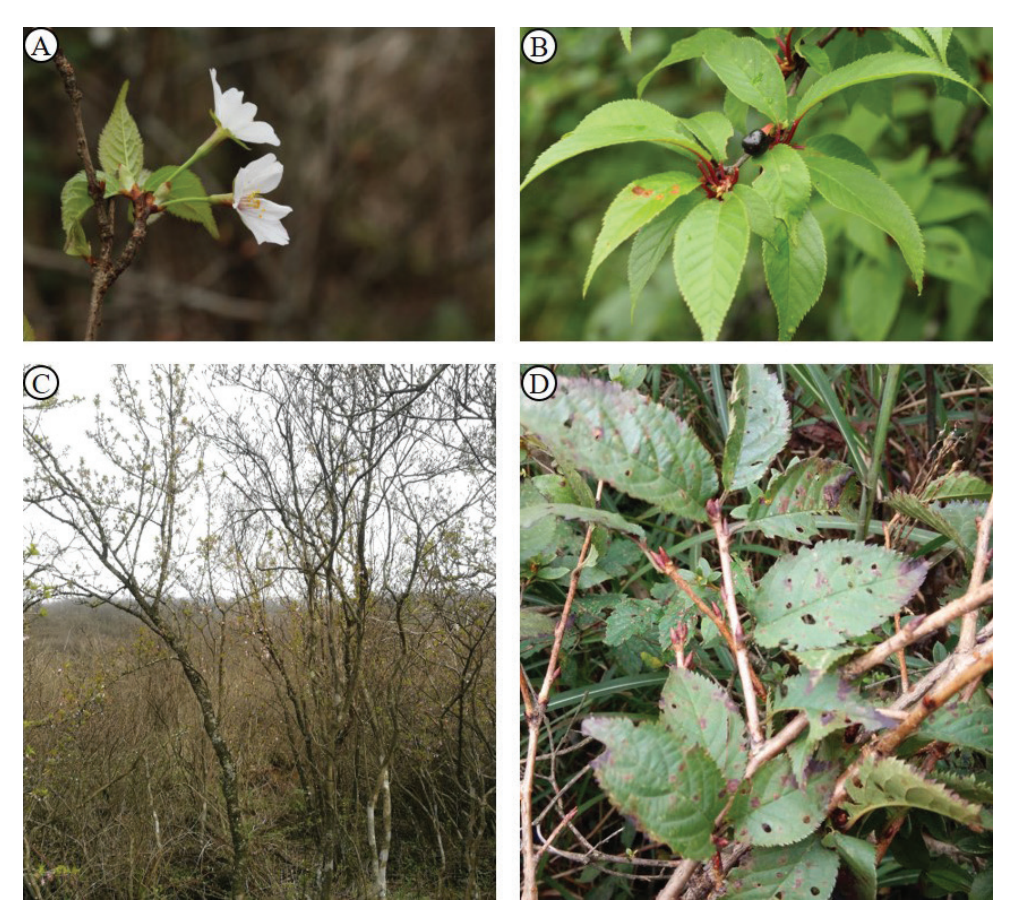
Figure 3. P. veitchii. A. Flower branch. B. Fruit Branch. C. Individual. D. Variation of the winter buds.

cuneate, abaxially pale green and glabrous, sparsely pilose or sometimes pilose when young, adaxially green and glabrous or sparsely pubescent, margin serrate or biserrate. Petiole 4–10 mm, glabrous or sparsely pilose, apex with 2 nectaries or not. Inflorescence umbellate or sometimes corymbose, peduncle short or inconspicuous, 1–4-flowered, involucral bracts spatulate or obovate-elliptic, bracts ovate, obovate or spatulate, margin serrate. Pedicel 6–25 mm, glabrous or sparsely pilose. Hypanthium tubular, 6-10 \times 1.5-3 mm, reddish-green to purplish, glabrous or sparsely pubescent. Sepals ovate-triangular to triangular-lanceolate, 3–5 mm, margin entire. Petals white or pinkish, obovate, apex emarginate, ca. 10 mm long. Stamens ca. 30–40. Style glabrous. Drupe ovoid or globose, ca. 8–10 mm in diam., glabrous, black when ripe. Flowering March-April, fruiting May-June.