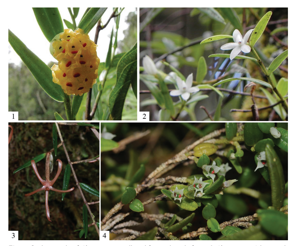
Figure 2. Photographs of Glomera species collected from online platforms. I Glomera aurea 2 Glomera macdonaldii 3 Glomera tubisepala 4 Glomera glomeroides.