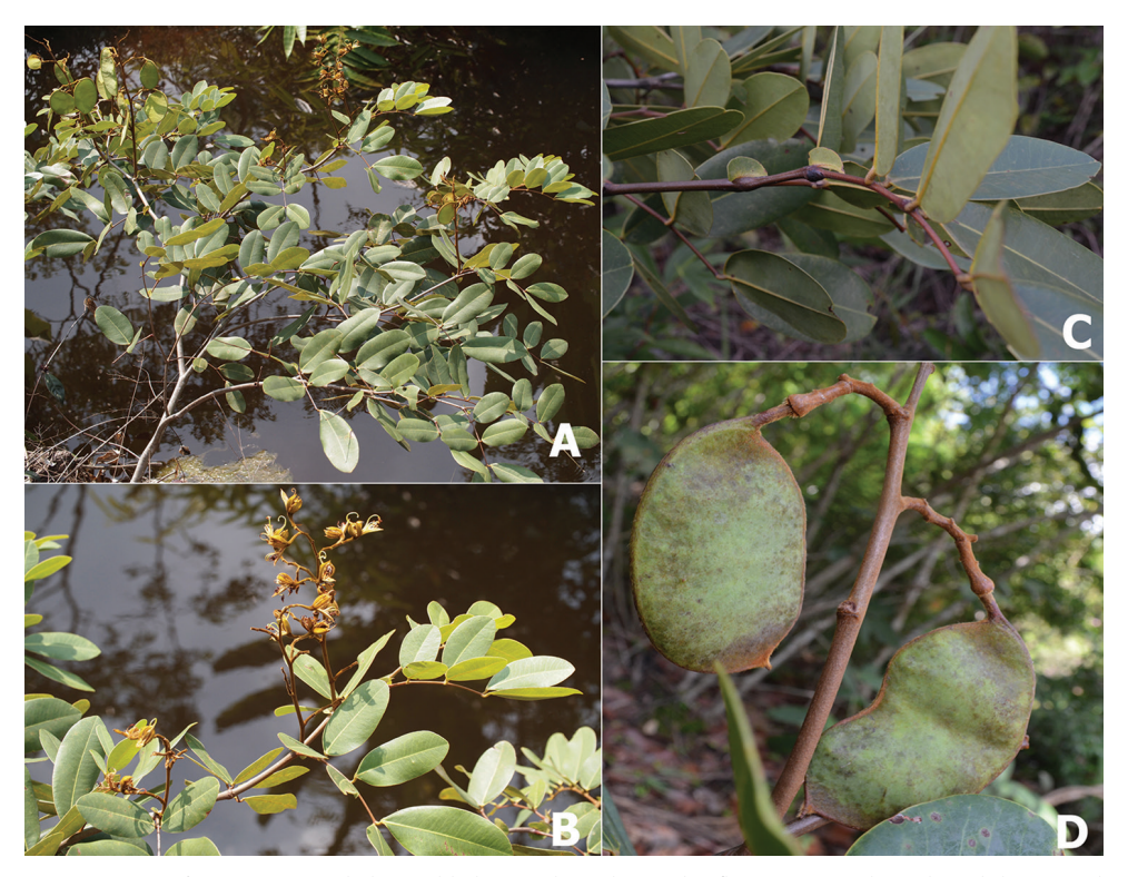
Figure 1. Sindora stipitata. A habit and habitat B branches and inflorescences C branch with leaves and stipules D branch with fruits.