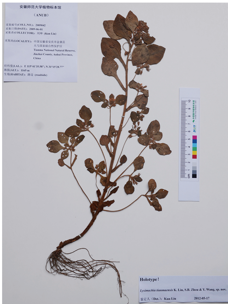
Figure 2. Holotype sheet of Lysimachia tianmaensis sp. nov.

900 m, 18 May 1984, G. Yao 9004 (NAS); Jinzhai County, Baimazhai, 700 m, 23 May 1984, G. Yao 9056 (NAS); Jinzhai County, Gubeizhen, 720 m, 4 May 2016, J. W. Shao ANUB00569 (ANUB).