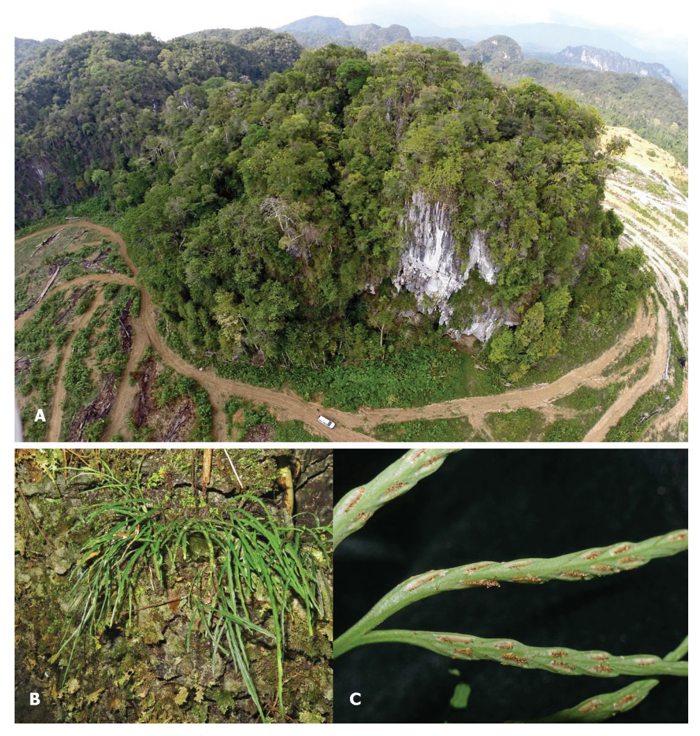
Figure 2. Asplenium merapohense R.Jaman & K.Imin, sp. nov. A Gunung Gajah B habitat – in crevices on a shaded, mossy limestone vertical cliff C Undersurface of a pinna with sori showing indusia. (Photographs by A P.T. Ong, B, C K. Imin).

The fact that this new species is extremely rare and known from a single population might suggest that it is a hybrid. Murakami et al. (1991) recorded that several non-fertile natural hybrids of Asplenium occur in Japan and that they were frequent where both parents occurred.