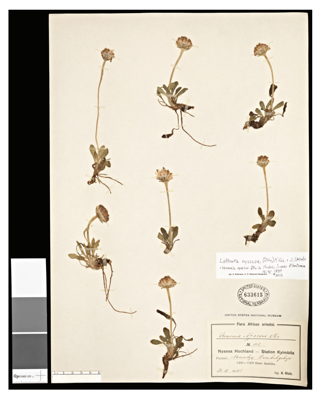
Figure 1. Herbarium specimen of Lettowia nyassae (Oliv.) H. Rob. & Skvarla (A. Stolz 103, US).

mostly 5–11 cm long, densely and stiffly hirsute, sometimes with small bract near middle, bearing 1 terminal head. Heads broadly campanulate, up to 2 cm high, 1.5–1.8 cm broad. Involucre with ca. 15–20 persistent, mostly subequal ovate-lanceolate bracts in ca. 2 series, up to ca. 1.5 cm long, apices acute, without acumination, densely pilose outside with long simple hairs, with 3 longitudinal veins, margins narrowly scarious, sometimes reddish. Receptacle epaleaceous; florets ca. 40 in a head; corollas lavender,