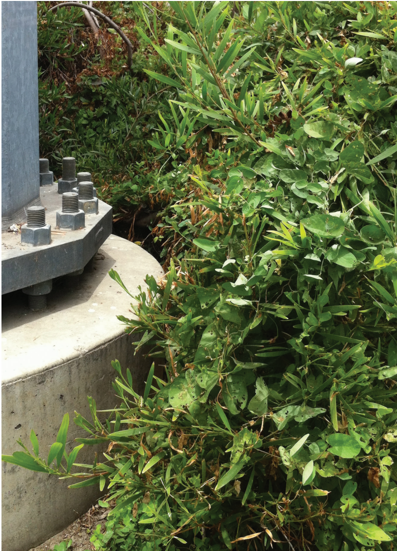
Figure 8. Calystegia felix climbing upward through urban landscaping in the City of Chino (Photo M. C. Provance, 2013).

alkali soil were conducted there. This property was described as being dominated by Anemopsis californica (Hilgard & Loughridge 1896), which indicates that it was likely alkali marsh. The Ten Acre Tract is now occupied by industrial buildings and offices. However, taxa highly indicative of alkaline marsh and alkaline meadow have persisted in unusual places. For instance, we documented a number of Anemopsis californica persisting in plantings of Hedera helix along a sidewalk in northeast Chino near the Ontario border, just within the mapped historical limits of moist ground. The following