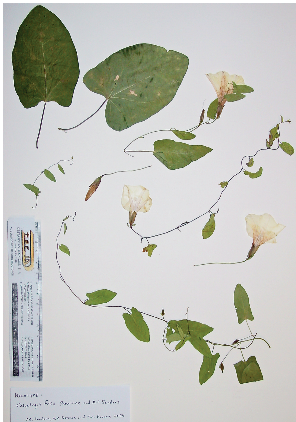
Figure 1. Calystegia felix Provance & A.C. Sanders, sp. nov. The holotype, A.C. Sanders & M.C. and T.A. Provance 40174 (UCR [UCR-246125]). The flowering branchlets are from a single ramet.