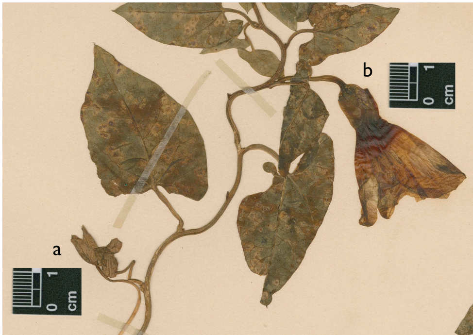
Figure 7. Original material of Convolvulus binghamiae Greene, Santa Barbara, 1886, E.L. Greene s.n. (NDG [NDG-66275]). Flower buds with large clasp- ing bracts typical of the Calystegia sepium complex are noteworthy (a), as is the solitary flower (b) with a broad calyx, broad corolla tube, and a smallish, but otherwise typical clasp- ing bract for the C. sepium complex (Image courtesy of Barbara Hellenthal at the Notre Dame Herbarium).

In 1945, Abrams annotated one sheet of Johnston’s C. felix collection at RSA as Convolvulus binghamiae , probably while preparing his Illustrated Flora (1951). The illustration of Convolvulus binghamiae in this flora seems to be C. felix , which is incongruent with his treatment, since the geographic distribution given by Abrams for Convolvulus binghamiae excludes all extant and historic occurrences of C. felix . Brummitt (1993) applied Calystegia sepium subsp. binghamiae (Greene) Brummitt, to plants of the northern and central South Coast between sea level and 20 meters elevation, which excludes collections from Chino. In Brummitt et al. (2012), the author’s recognize the similarity of material we refer to C. felix to the illustration in Abrams flora, noting, “A good illustration of the latter may be seen in Abrams (e.g., Fig. 3855, 1951)”. However, they propose that the drawing represents a phenotypic variant of their proposed Calystegia binghamiae (Brummitt) Brummitt. The misidentified collections at RSA and the illustration in Abrams of what was actually an undescribed species seems to have influenced the search image of at least some local botanists attempting to rediscover C. sepium subsp. binghamiae .