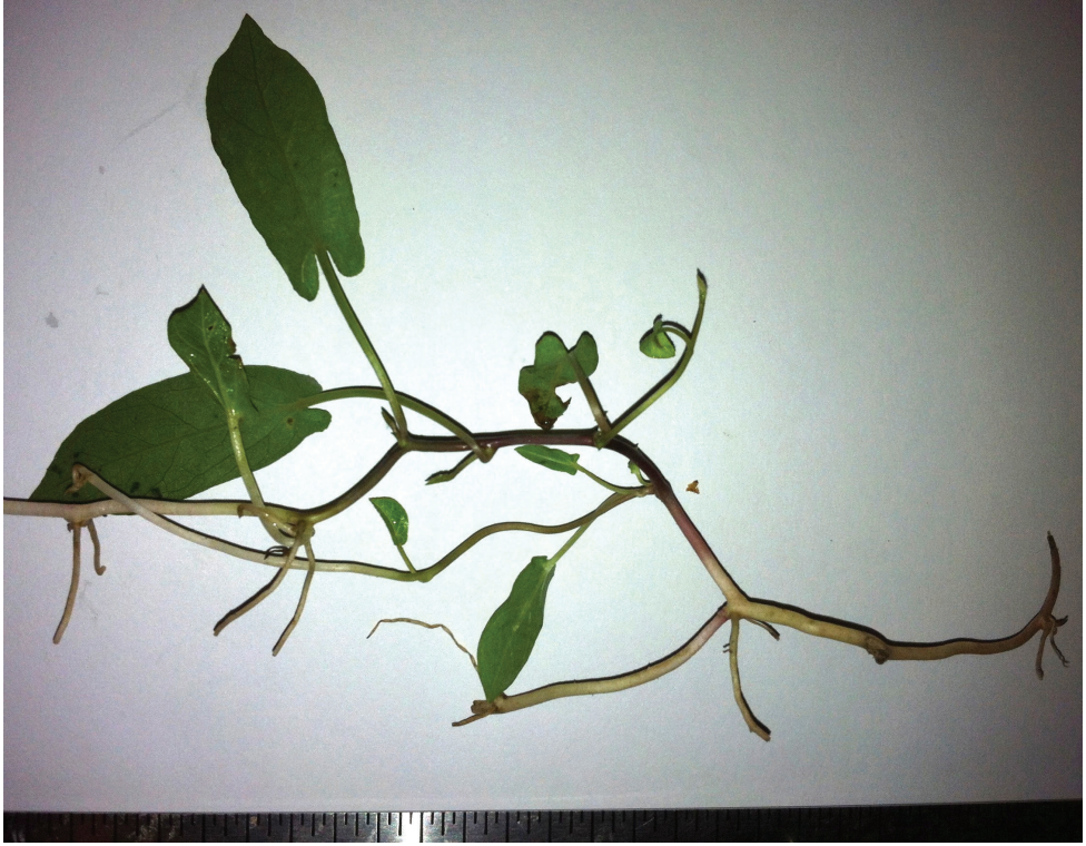
Figure 2. Calystegia felix stolons and creeping rootstock. The narrow emergent leaves of this specimen may be atypical; the relatively long petioles are normal.

ing along the midrib, but sometimes the basal half of the lamina slightly involute, and often having the basal lobes abruptly turned upward. Petioles on climbing stems 0.3\text{--}0.5 \times length of lamina, e.g. about 14–61 mm long, but often longer relative to lamina length on emergent leaves; lamina of climbing stems 45–115(–122) mm long, 30–80(–96) mm wide, oblong-ovate to broadly ovate, but narrowly oblong on the sterile branchlets and on stems distal to the flowering axils, base cordate, with short, rounded, parallel or barely diverging basal lobes, sometimes essentially without basal lobes and nearly truncate, apex obtusely rounded, sometimes subacute, minutely apiculate; emergent leaves from rhizomes and on trailing stems variable in shape, but usually broadly oblong to oval or orbicular, sagittate, with short lobes, or lobeless and rounded to the petiole, apex broadly rounded; lamina venation obscurely pinnate, but with 2–4 lateral veins from the base. Inflorescences axillary, flowers usually solitary, rarely 2–3(–4)-flowered; pedicels 1–30 mm long, peduncles 18–63 mm long; bracts 2, attached (1–)2–3(–4) mm below the calyx, ascending, subopposite, 5–14 mm long, 1–2.5(–3.5) mm wide, narrowly elliptic to narrowly oblanceolate, obtusely pointed, \pm flat, with a raised midvein, glabrous to scanty puberulent. Flowers perfect; sepals 5,