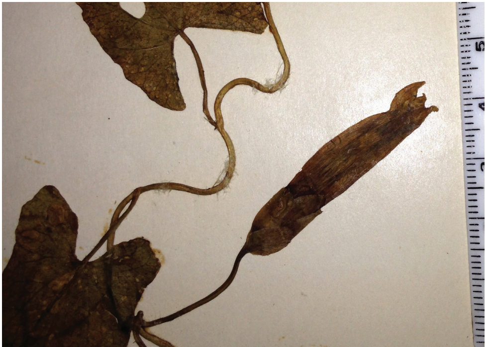
Figure 5. Lectotype of Convolvulus binghamiae Greene, Santa Barbara, July, 1886, R.F. Bingham s.n. (UC335392), with one small bract, and a broad-based corolla.

from 7 to 13.8 mm long and 3.1 to 9.1 mm wide, and in their fully developed state are broadly lanceolate to broadly ovate. Inflorescence bracts in C. felix have a similar range in length, but are much narrower at 1 to 3.5 mm in width, and usually lack a conspicuous network of veins. Most bracts in the Convolvulus binghamiae original material are in every sense typical of the C. sepium complex. Interestingly, some of the largest bracts are associated with flower buds: in one case (Fig. 7), some of the bracts of the flower buds are larger than the bracts of the open flower on the same sheet. Finally, the corolla tubes (measured at the base of the sepal lobes) in the C. binghamiae original material are over 8 mm wide. In C. felix the lower tube of the corolla is narrow, ranging from 4 mm to about 6 mm in width. Calystegia felix is clearly not part of the Calystegia sepium complex, and represents a new, unrelated, and previously undescribed taxon.