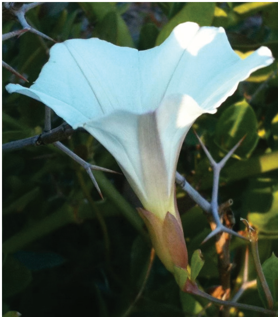
Figure 3. Calystegia felix in bloom at the type locality, in a planter bed in Chino. This plant, discovered in 2011, is the only one we have seen that produces corollas with reddish-purple midpetaline stripes. Also, note the blushed sepals.

Additional specimens examined. USA. California. San Bernardino County: Chino Creek south of Ontario, climbing in trees, 500 ft., 30 May 1917 (H), I.M. Johnston 1274 (RSA, POM, UC); City of Chino, 33°59.823'N, -117°40.537'W, 206 m, SCE right-of-way, just northeast of Chaffey College, southeast corner of the intersection of Edison Rd. & Oaks Ave., 11 May 2011, M.C. Provance 17214 (UCR); same location, 14 May 2011, M.C. Provance 17351 (UCR, UC, DAV, NDG); same location, 25 Mar 2012, M.C., J.M., & T.A. Provance 17430 (UCR, WIS); West Chino, east