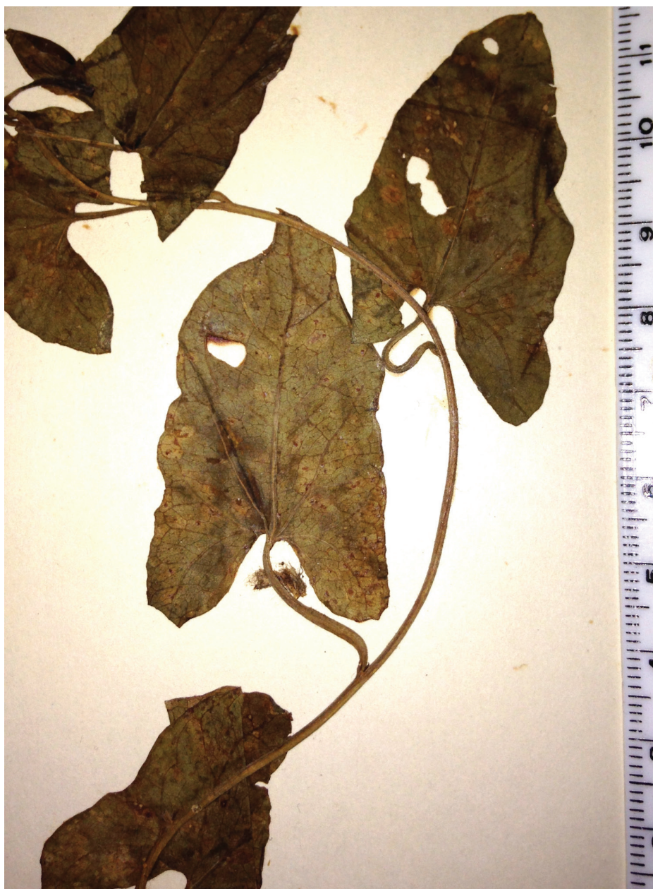
Figure 6. The leaves shown here from R.F. Bingham s.n. (UC335392) are consistent with many specimens of Calystegia sepium .

seen a collection of C. felix at some point, it is not obvious where he would have placed such a collection in his 1939 treatment.