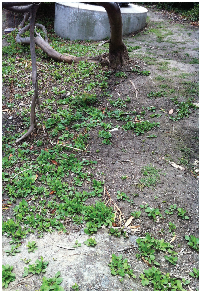
Figure 9. Emergent Calystegia felix on crusted, moist, Chino silt loam, amongst urban landscaping. It is unknown if large groups of emergent plants such as these represent one to just a few clones, or many genotypes.

year we found Calystegia felix growing in a sidewalk planter across the street from the Anemopsis site, in similar urban landscaping. We think other remnants of the ciénega flora may persist in Chino.