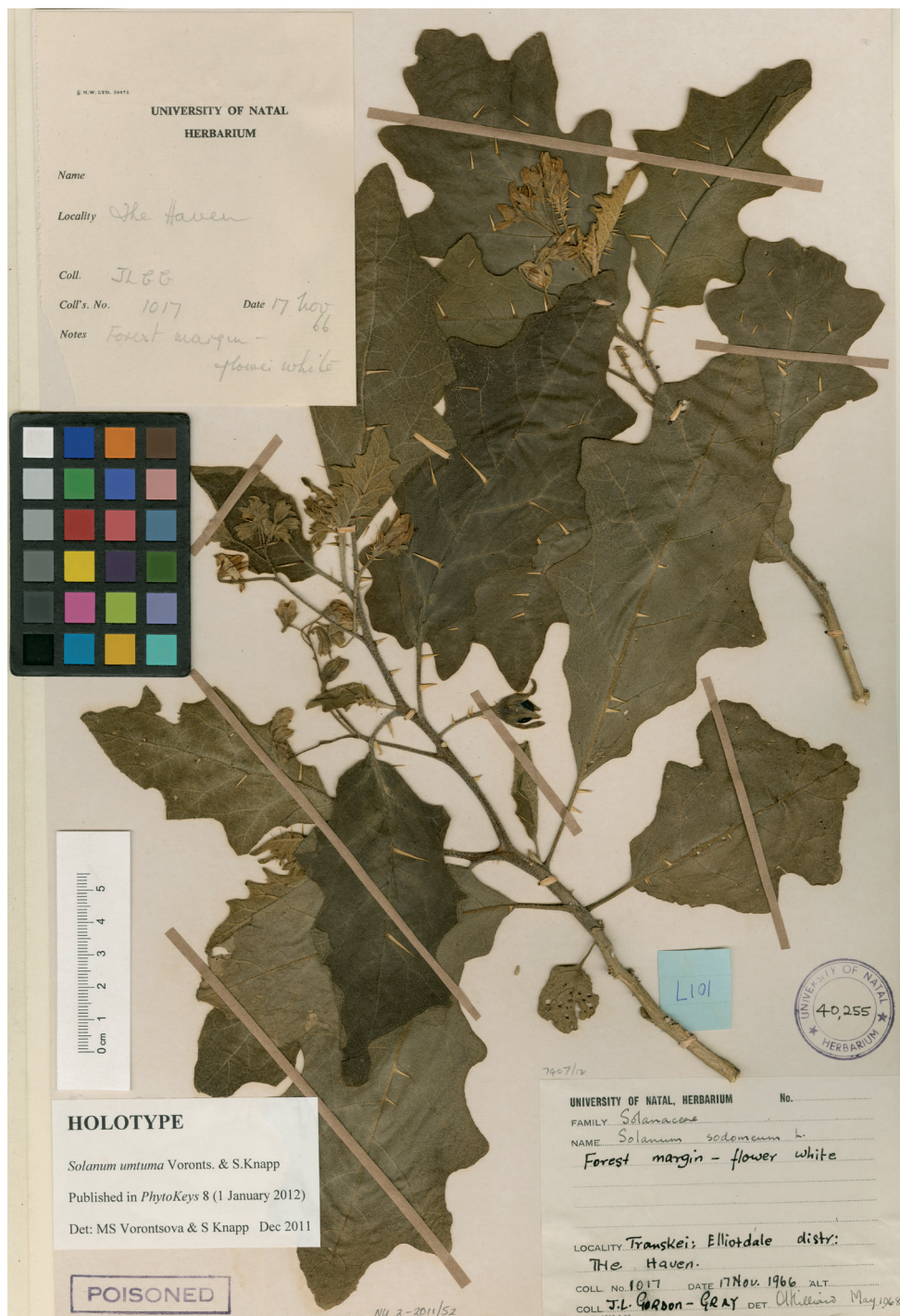
Figure 2. Photograph of the holotype of Solanum umtuma (J.L. Gordon-Gray 1017, NU-40255).