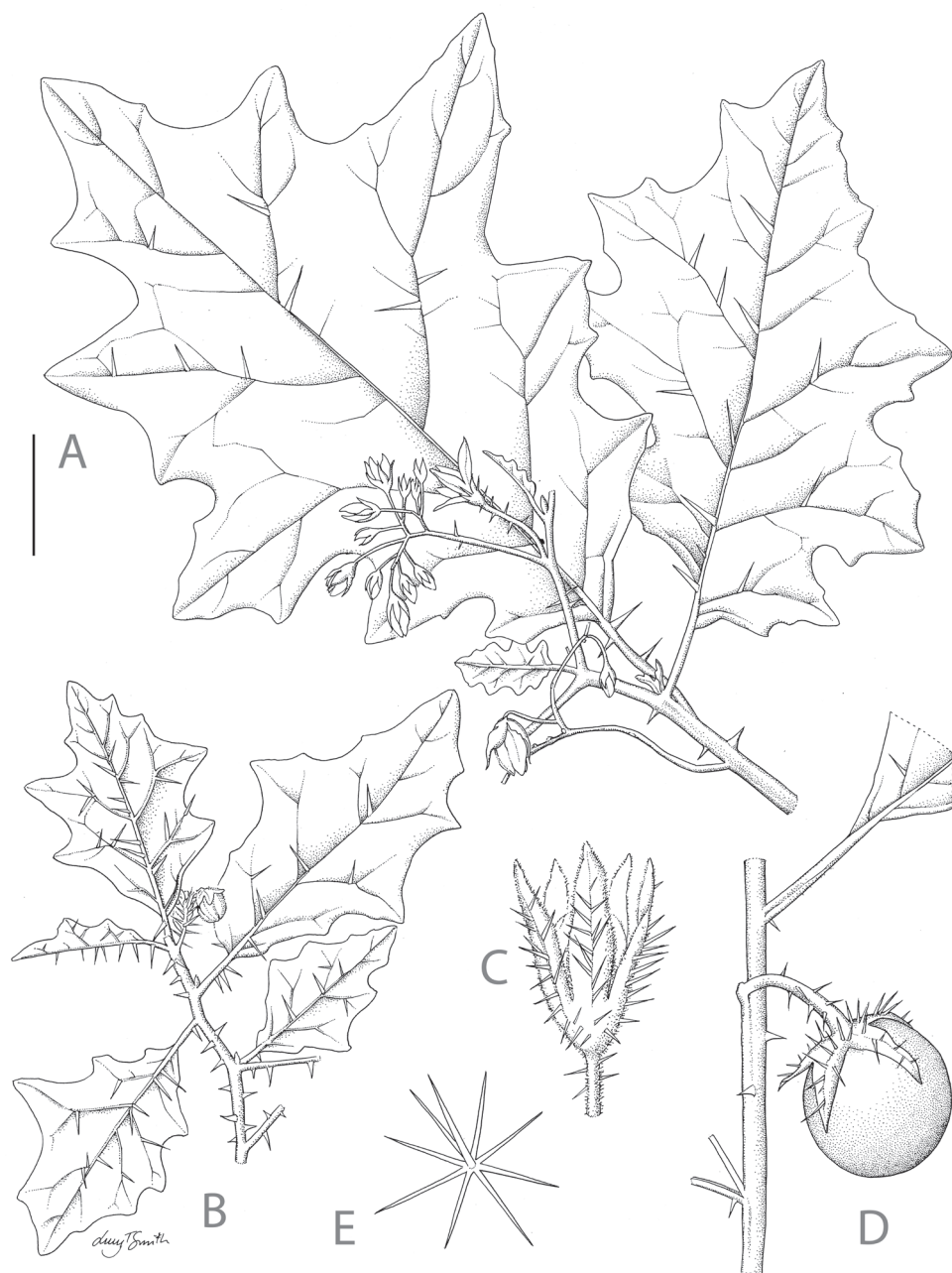
Figure 1. Solanum umtuma . A Habit with pronounced secondary leaf lobes and sparse prickles B Habit with few secondary leaf lobes and dense prickles C Calyx of a long-styled flower at anthesis D Fruiting branch E Porrect stellate trichome from the adaxial surface of a leaf. Scale bar: A, B, C = 3 cm; C = 1.5 cm; E = 0.5 mm. A, E from Gerrard 295 ; B-D from Arnold 35934 . Drawn by Lucy T. Smith.