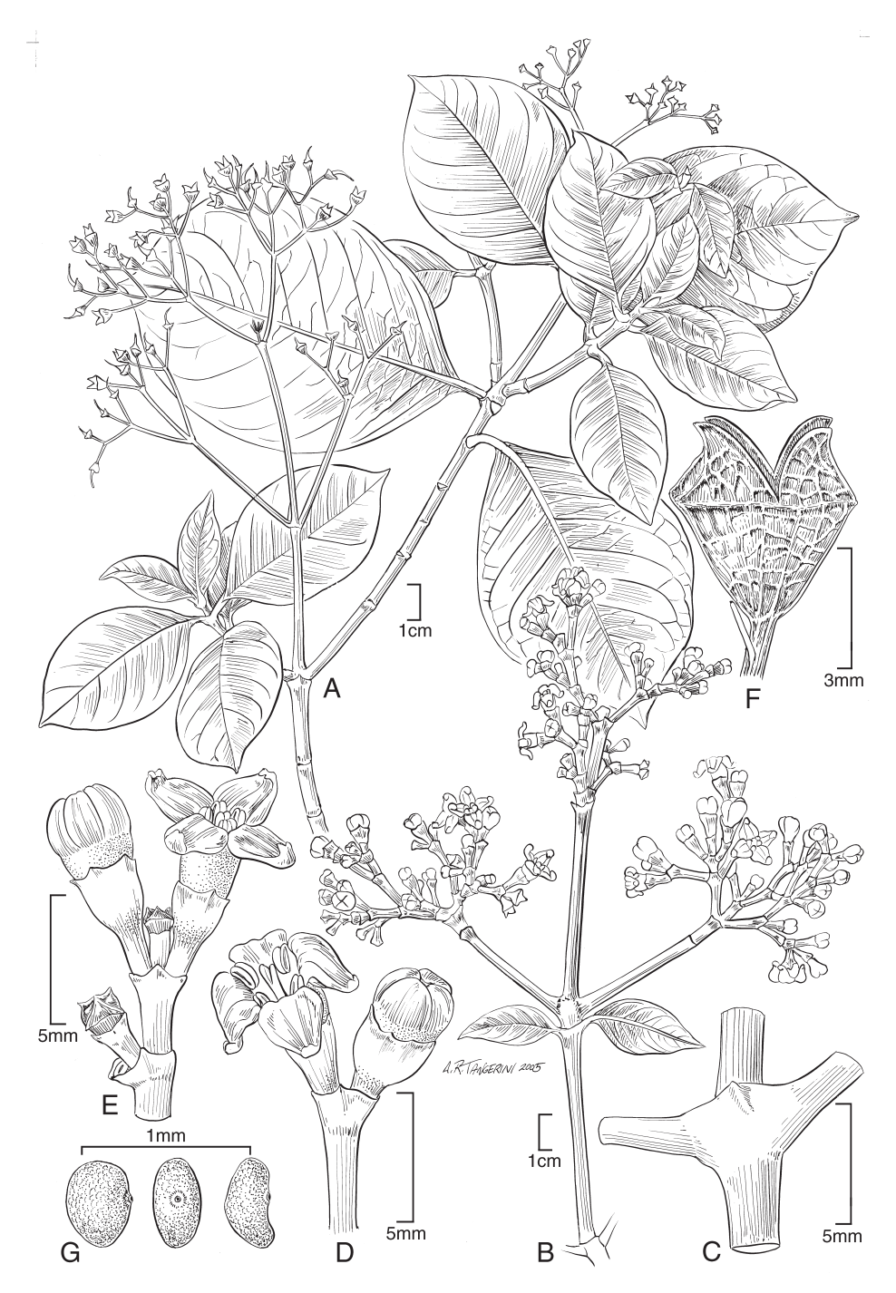
Figure 1. Kadua lichtlei Lorence & WL Wagner A habit, fruiting branch B inflorescence C node showing stipule and petiole bases D , E flowers in bud and at anthesis F mature capsule, dehisced G seeds, lateral and dorsal (center) views. A , F , G . based on the type collection Wood & Meyer 10554; B , C , D , E based on Lorence 9476.