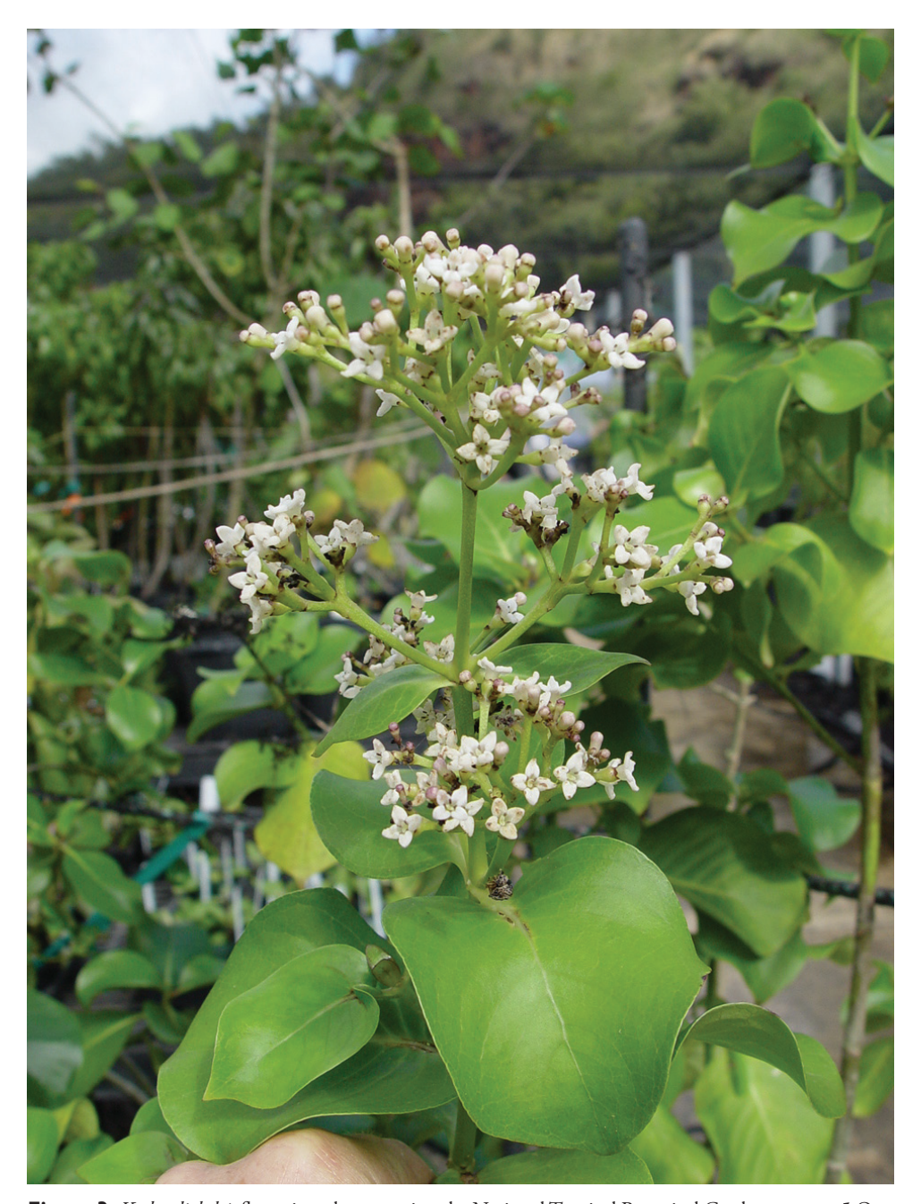
Figure 3. Kadua lichtlei , flowering plant growing the National Tropical Botanical Garden nursery, 5 Oct. 2005, Lorence 9476 (PTBG).

colorous, chartaceous to subcoriaceous, base acute to obtuse or rounded, apex acute to obtuse or rounded, often abruptly short acuminate, margin entire, weakly revolute; secondary veins 8–10 pairs, loosely brochidodromous, secondary veins prominulous