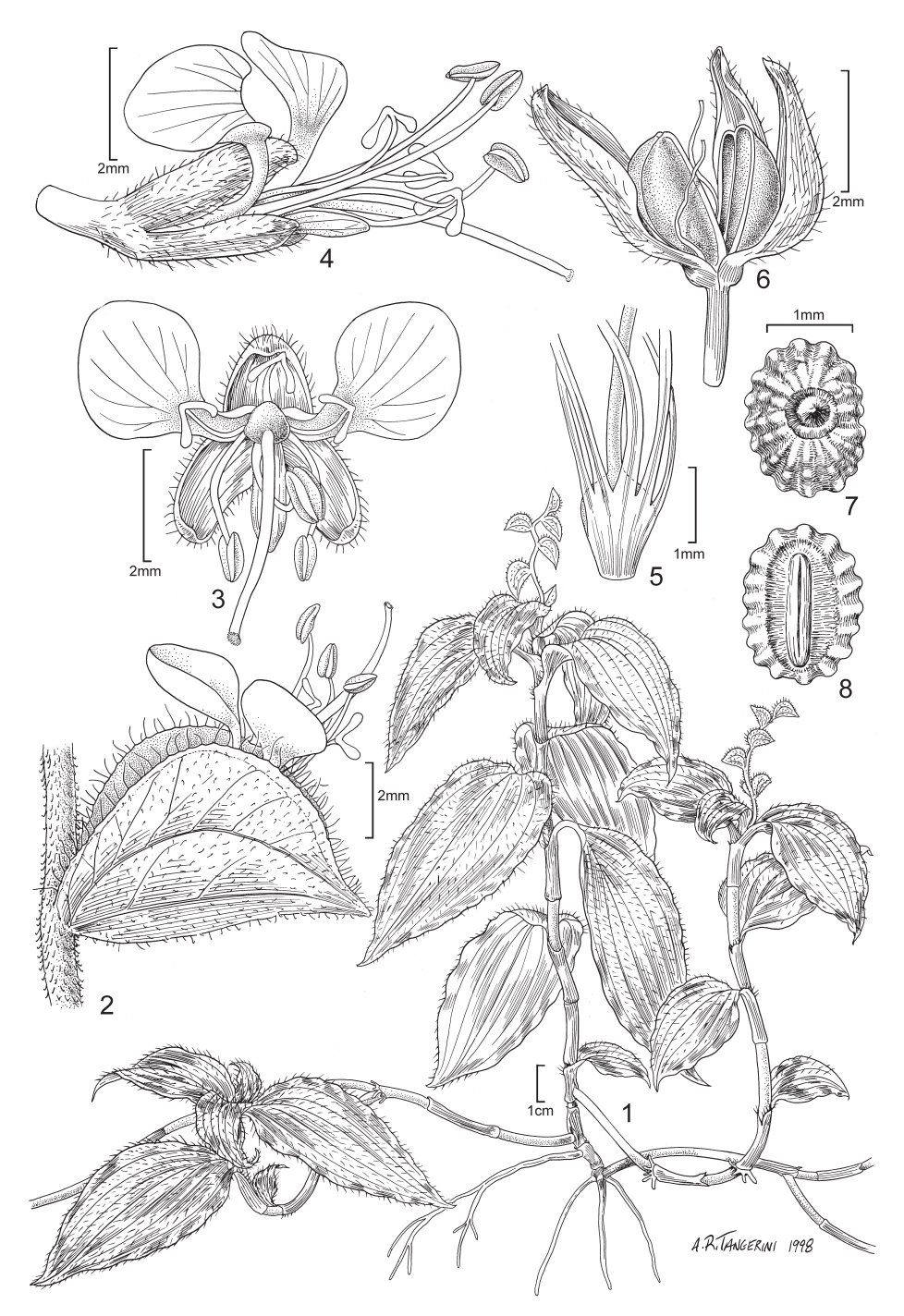
Figure 1. Polyspatha oligospatha Faden, sp. nov. 1. Habit. 2. Spathe with open flower, side view. 3. Flower, front view. 4. Flower, side view. 5. Stamen and staminode filaments, showing basal fusion. 6. Dehisced capsule. 7. Seed, dorsal view. 8. Seed, ventral. All from Poulsen 1275 (originally from Uganda; cultivated at the Smithsonian Institution). Illustration by A. R. Tangerini.