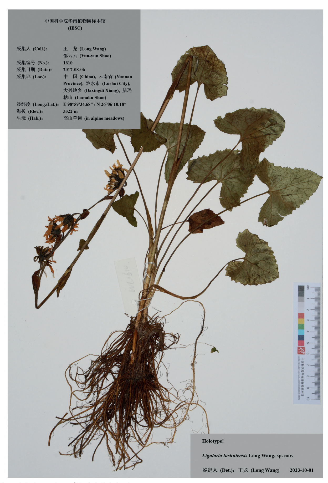
Figure 2. Holotype sheet of Ligularia lushuiensis sp. nov.