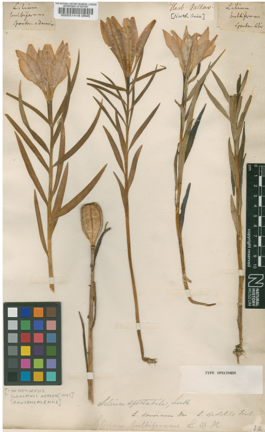
Figure 7. Peter Simon Pallas's specimens of L. pensylvanicum from Siberia that may have been in Aylmer Bourke Lambert's Herbarium BM000551418.