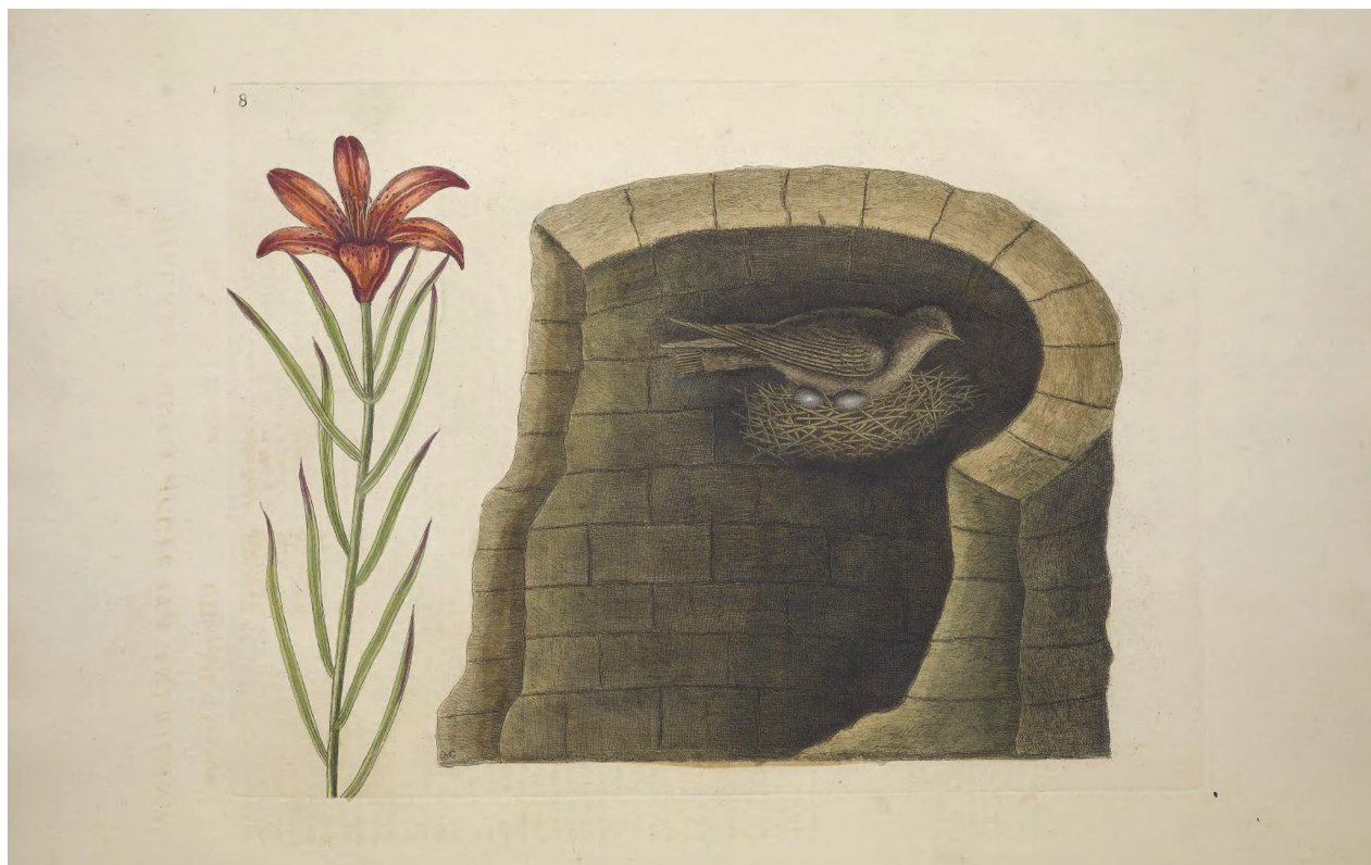
Figure 5. Watercolour of L. pensylvanicum as ' Lilium angustifolium, flore rubro singulari ' in the Appendix to Mark Catesby's The Natural History of Carolina, Florida and the Bahama Islands (Catesby 1747: App. t. 8).