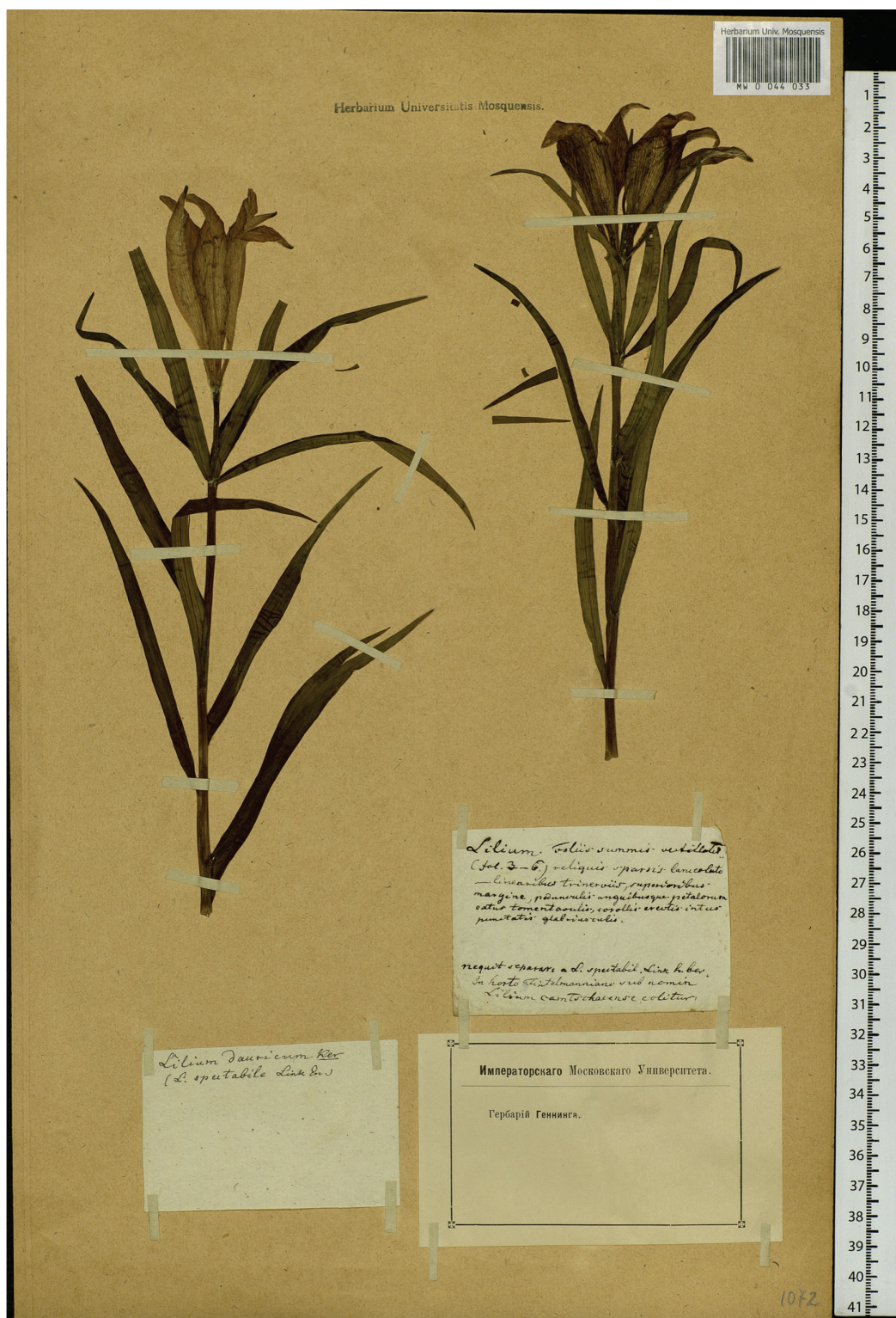
Figure 2. Moscow University specimen MW0044033 of L. pensylvanicum bearing 'In horto Fintelmanniano' label.